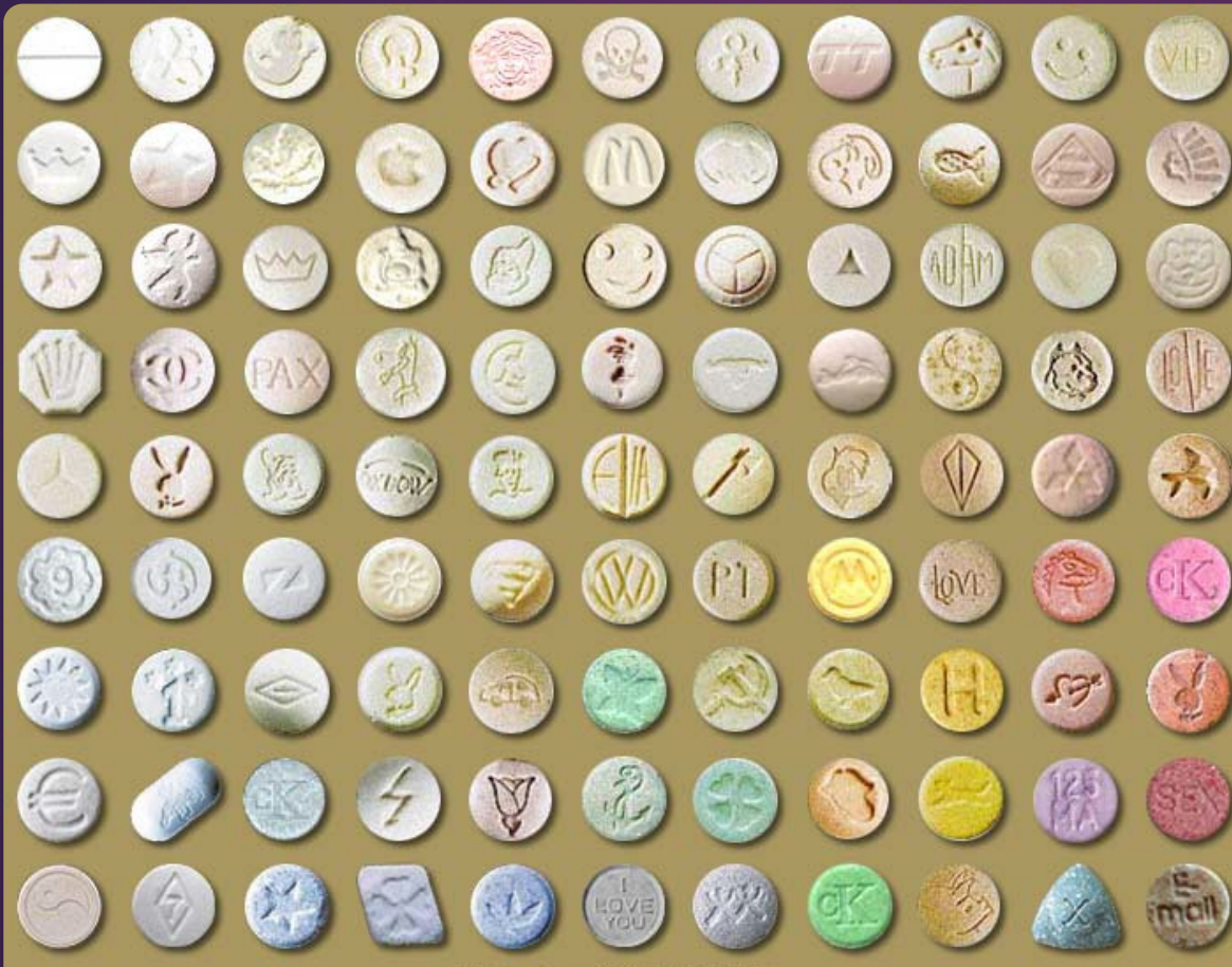
99 Ecstasy (MDMA) Tablets