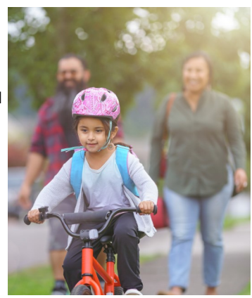
Bicycling or walking are great active options for summer travel! Stay safe while out and about with tips and resources from MDT.

here's nothing like getting outside after a long winter and breathing in some fresh Montana air! Taking a walk or riding a bike to accomplish your errands or commute is the easiest way to get some activity in to your day and enjoy the warmer weather. In line with MDT's goal of Vision Zero, we ask all travelers - motorized and nonmotorized - to be attentive and courteous when using our state's transportation system. Whether you are walking, bicycling, riding, or driving, it's important for everyone to know and follow relevant traffic laws and prioritize safety when out and about. A little courtesy will help everyone reach their destination safely. To celebrate the arrival of warmer weather, MDT would like to remind everyone of some key safety tips.