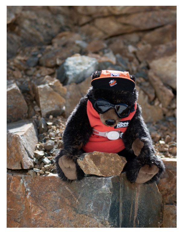
JD, Beartooth Highway mascot, oversees clearing activities at the 2023 Media Day.

If you have questions about the SOAR program or would like to assist with this project, contact Sheila Cozzie at 406-444-7301 or scozzie@mt.gov.