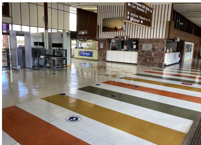
Yellowstone Airport terminal.

The airport opened May 1 to all general aviation traffic and saw its first commercial flights on May 6. We hope to see you visit the airport in West Yellowstone, Montana, in our 2021 season!