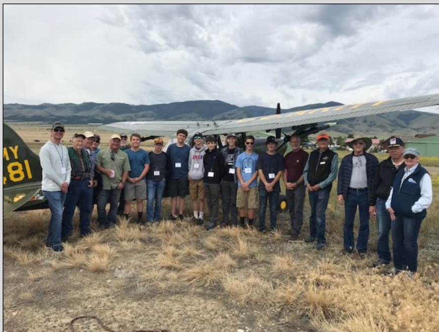
2019 ACE Camp—Canyon Ferry Fly-In

On the first day, students will learn survival skills, signaling, and fire and shelter construction during a campout in the mountains. Later in the afternoon, students will have an opportunity to signal a search plane to locate them in the mountains using their newly learned rescue methods.