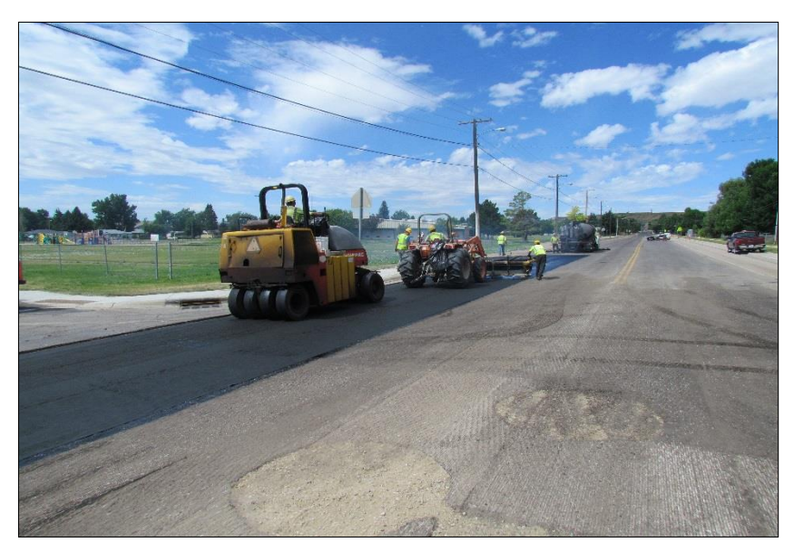
← As the first pass begins a pneumatic compactor 9-wheel roller follows close behind to insure good adhesion to the fabric, tack coat and underlying pavement.