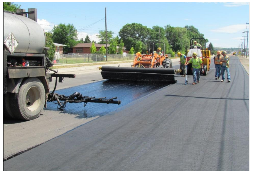
← View of fabric placement at front end of geotextile train.