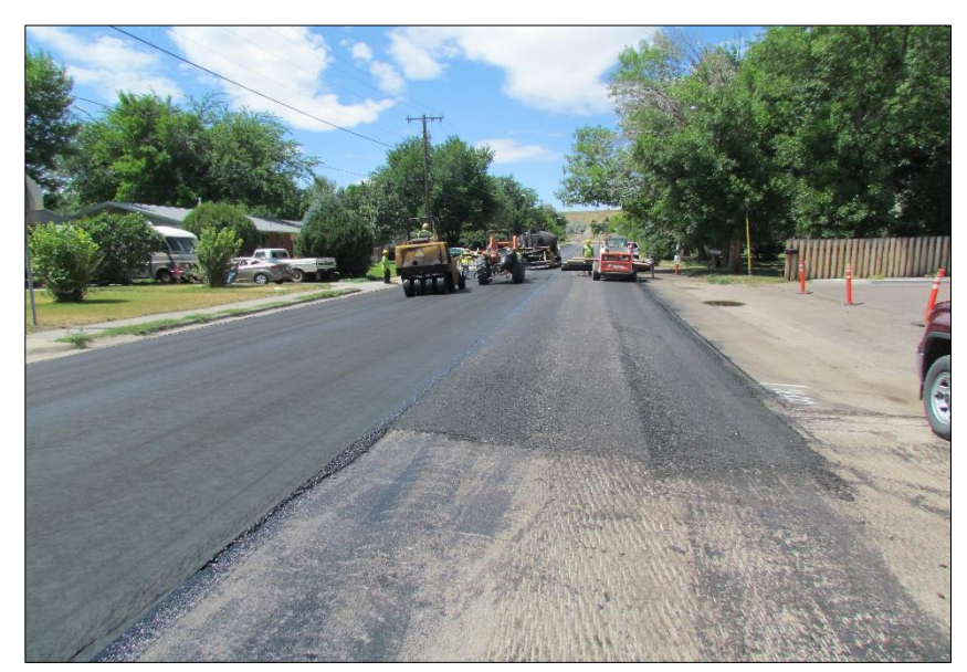
← Note that on the west end of the project (approximately 5<sup>th</sup> St. NW to 2<sup>nd</sup> St. NW), the condition of the milled pavement required a 1/2" leveling course of AC prior to the placement of the geotextile.