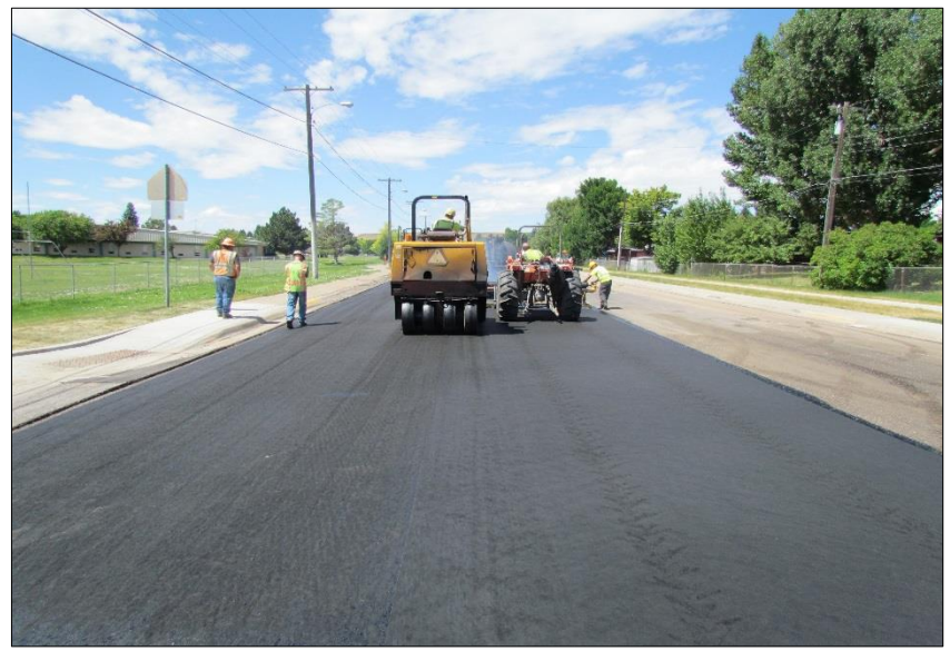
← The second pass of fabric being applied. Note the pneumatic roller insure a direct pass over the overlapping geotextile seam.