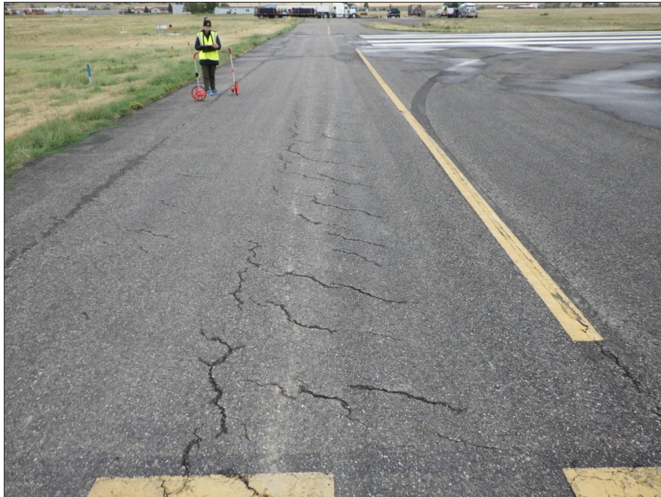
TW01-03: Slippage Cracking