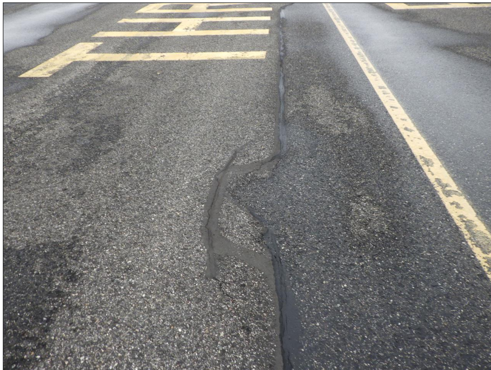
AP01-03: L&T Cracking