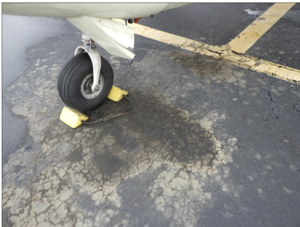
AP01-12: Oil Spillage