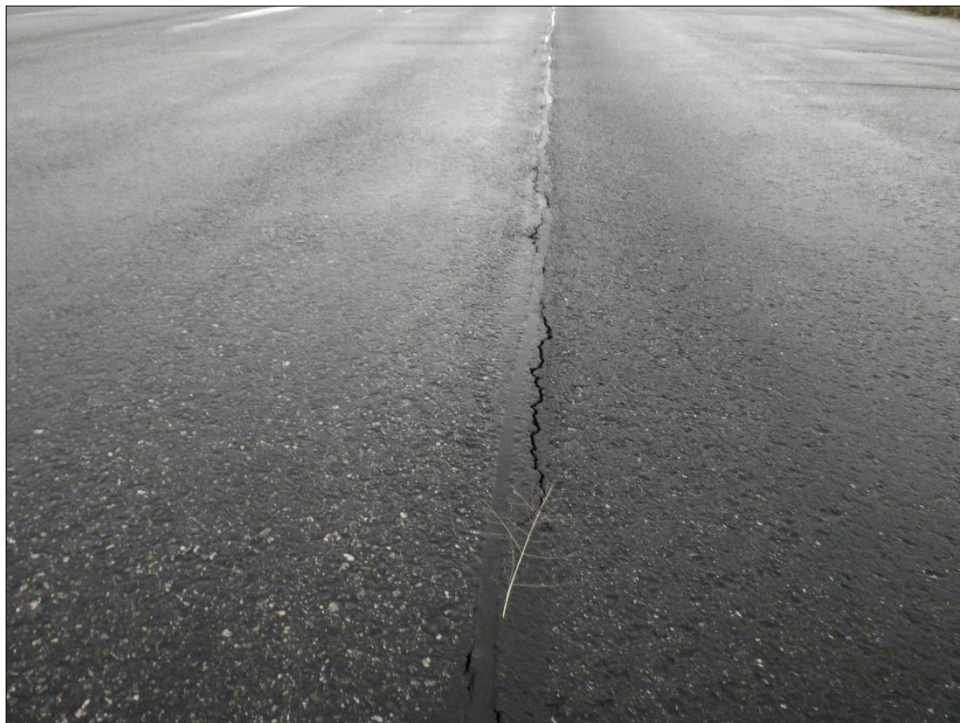
RW03-02-07: L&T Cracking