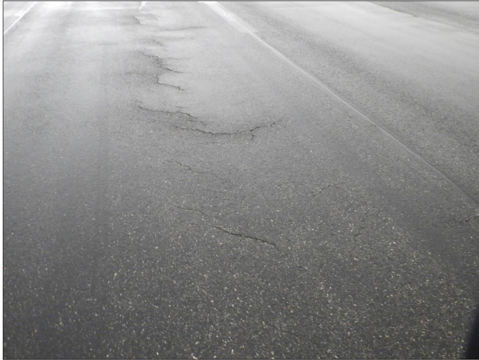
RW03-01-21: Slippage Cracking