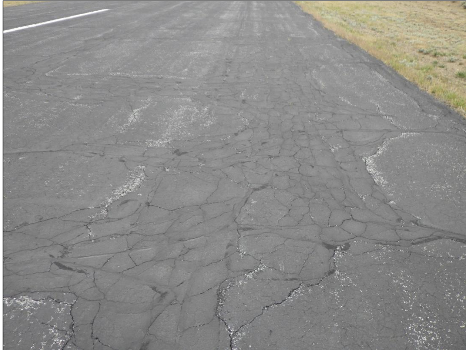
RW16-01-16: Alligator Cracking