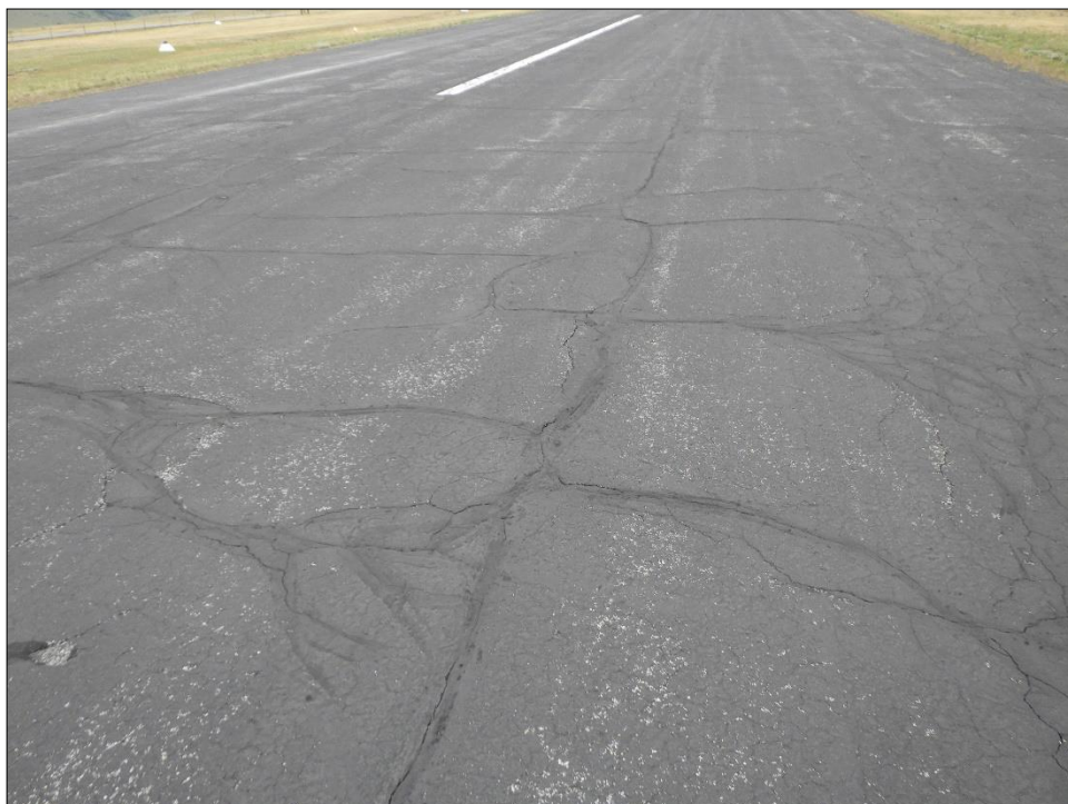
RW16-01-32: Block Cracking