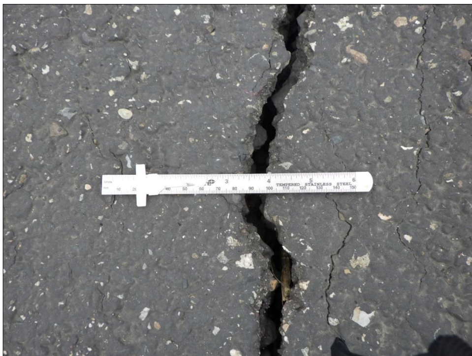
AP01-19: L&T Cracking