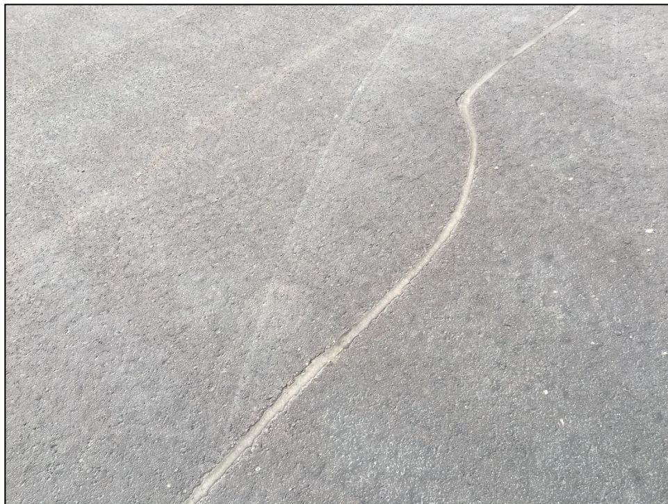
AP01-05: L&T Cracking