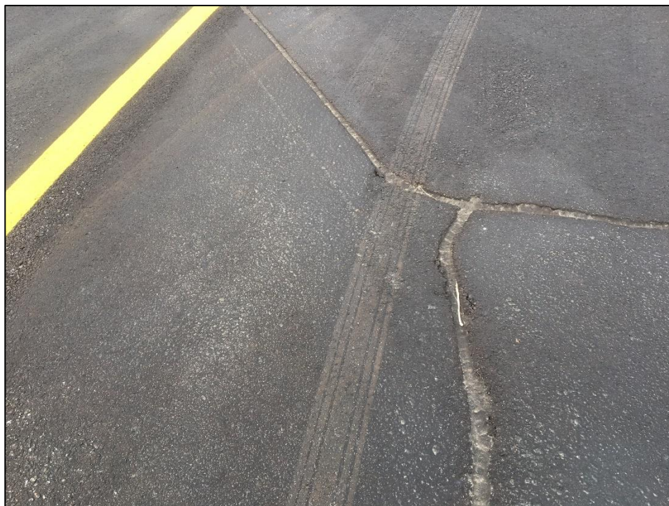
TW01-11: L&T Cracking