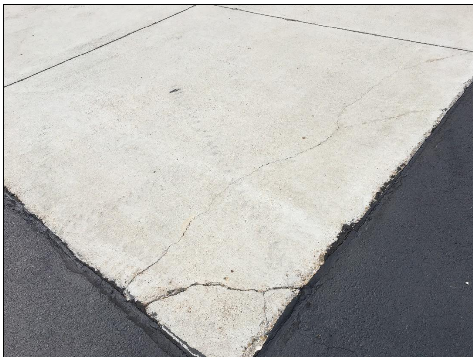
AP02-01: Shattered Slab