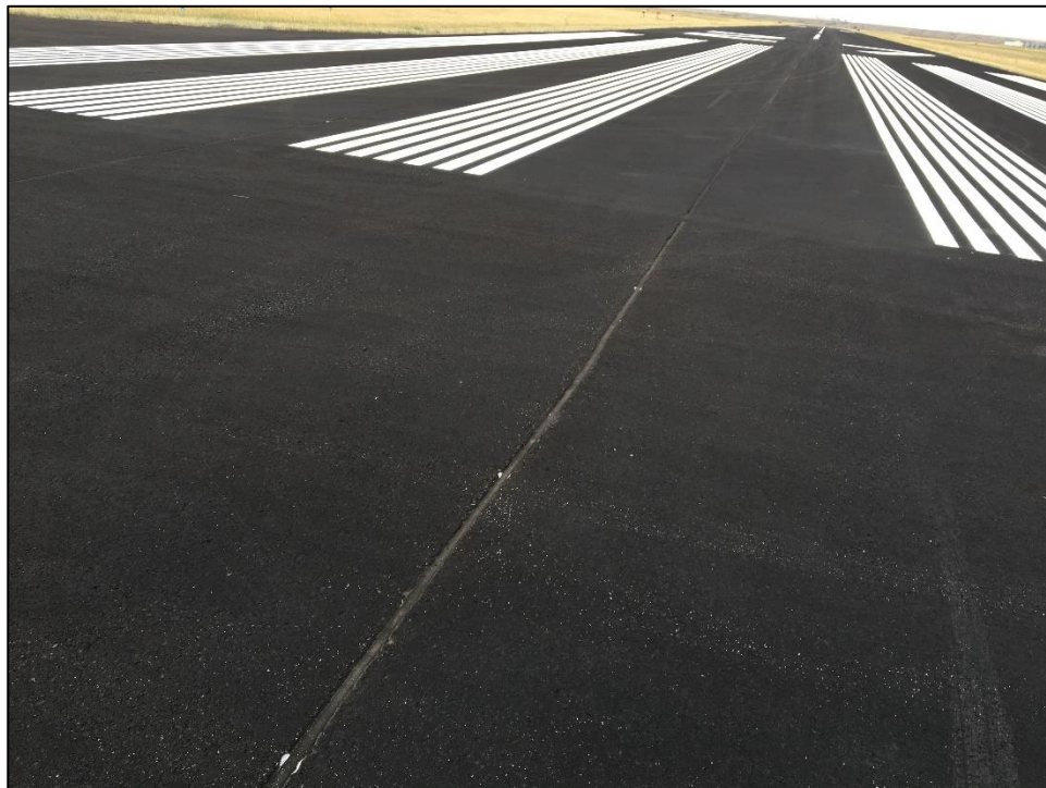
RW09-01-01: L&T Cracking