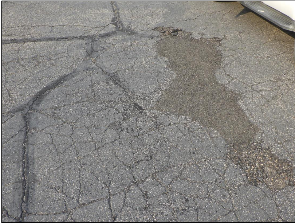
TW01-02: Alligator Cracking and Raveling