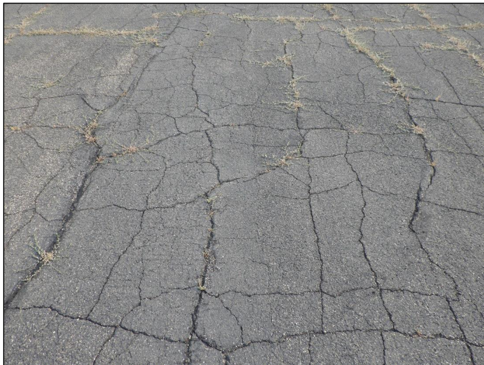
AP01-02: Alligator Cracking and Block Cracking