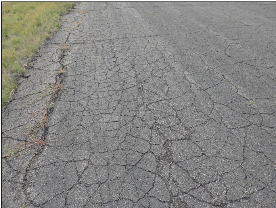
TW01-02: Alligator Cracking