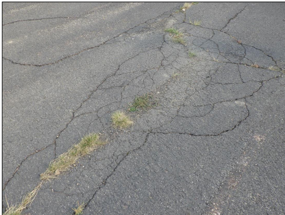
TL01-02: Alligator Cracking and Depression