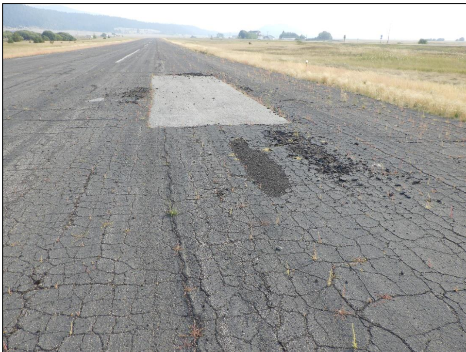
RW16-01-42: Alligator Cracking and Patching