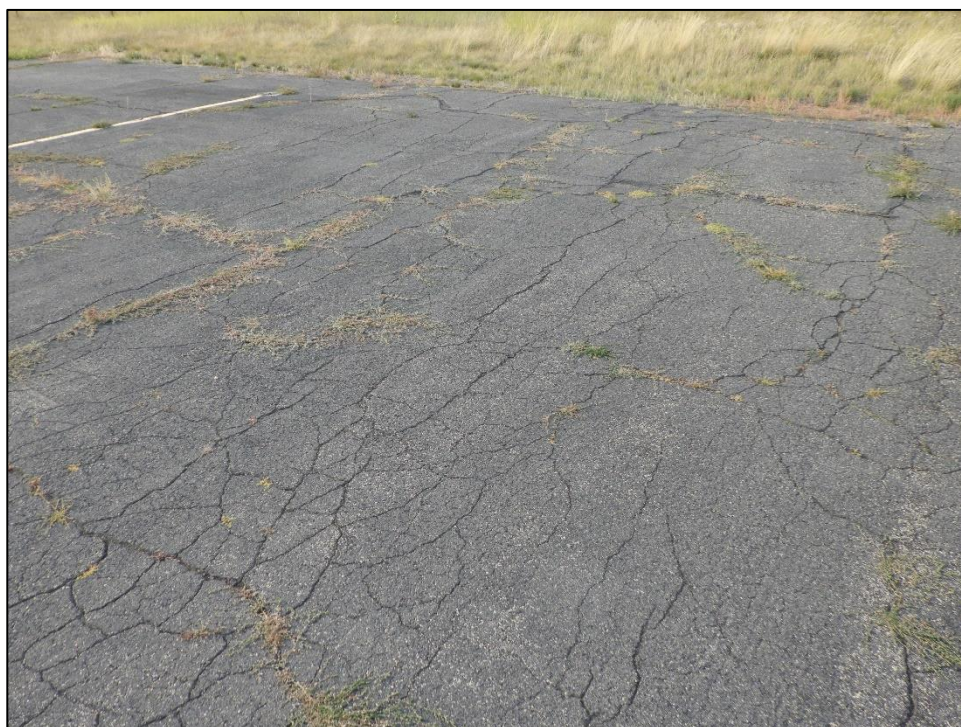
AP01-02: Alligator Cracking and Block Cracking