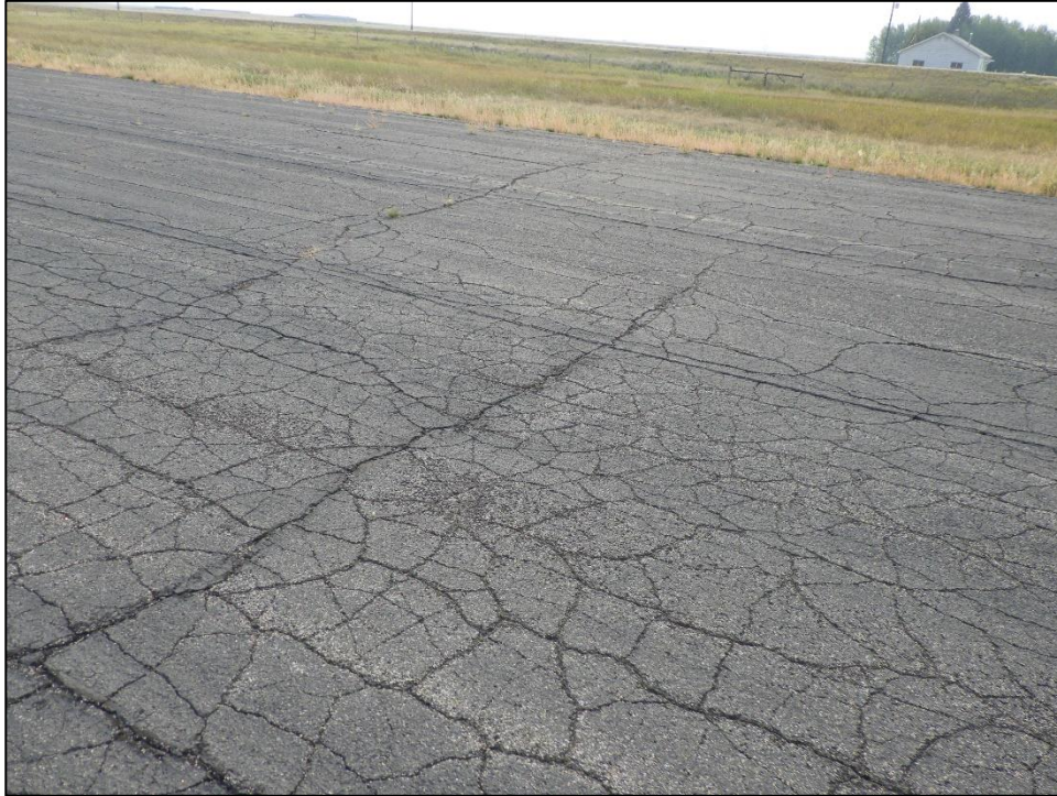
RW16-01-42: Alligator Cracking