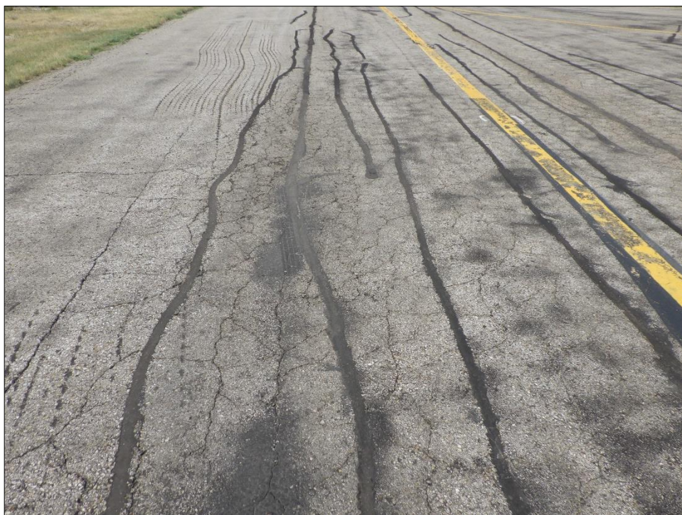
TW88-01: Alligator Cracking