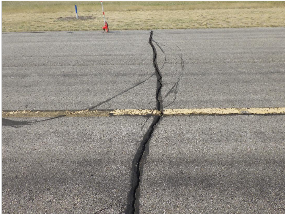
TW07-03: L&T Cracking