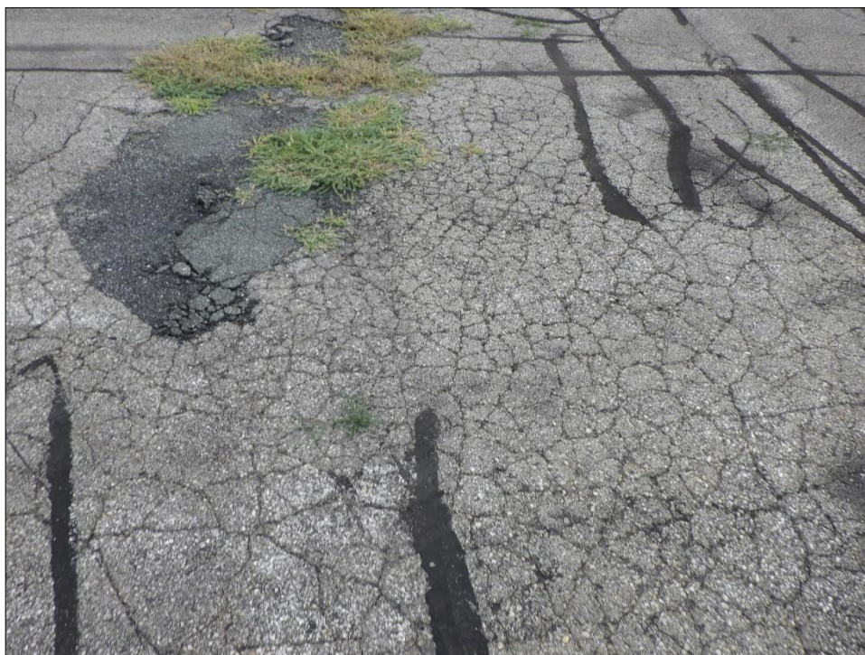
AP03A-02: Alligator Cracking