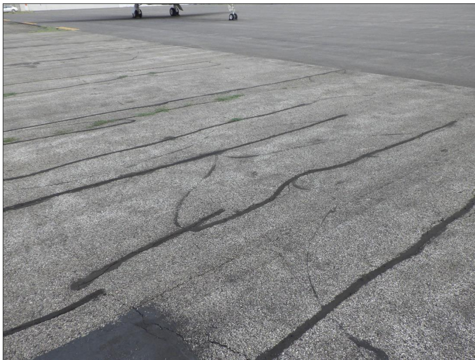
AP02-01: L&T Cracking