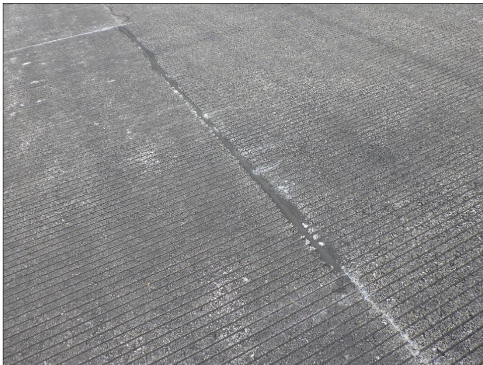
RW08-34-10: L&T Cracking