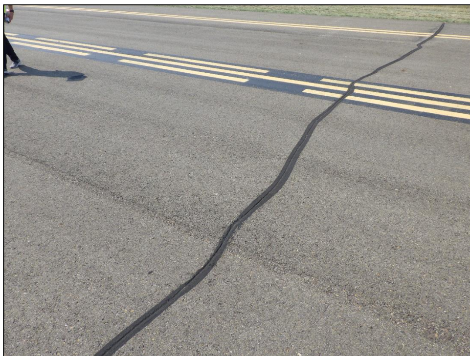
TW13-03: L&T Cracking