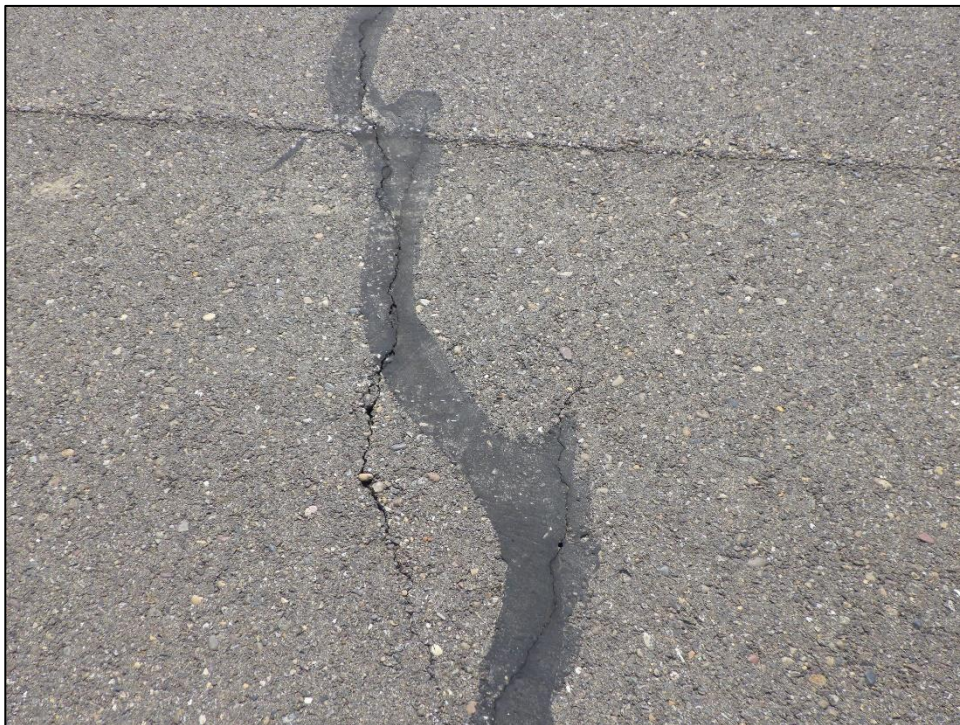
AP15-12: L&T Cracking