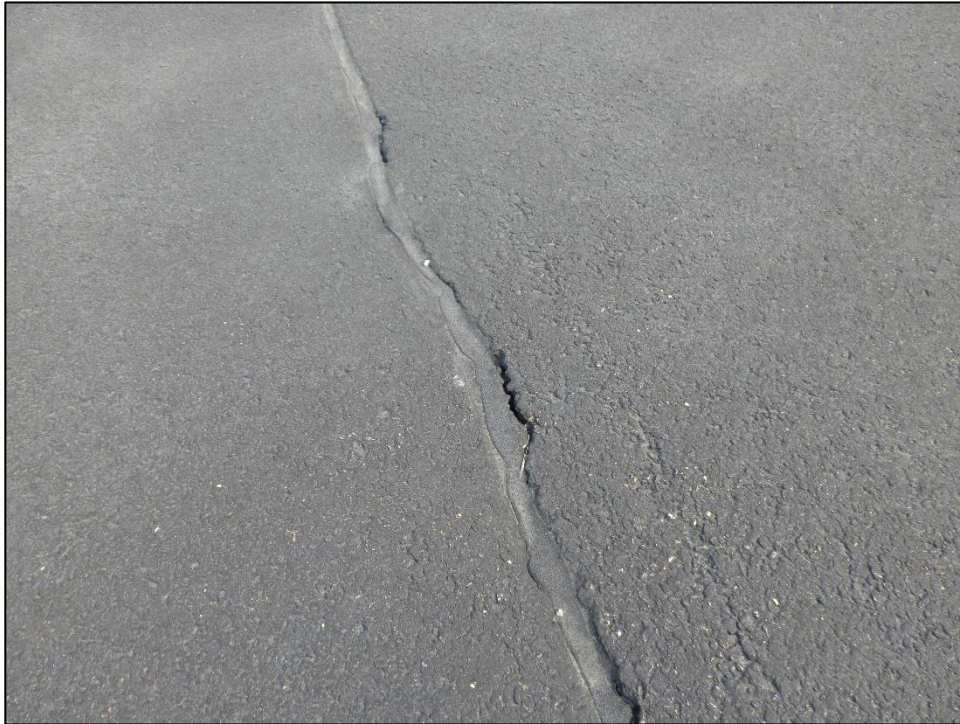
AP02-02: L&T Cracking