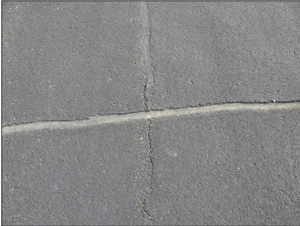
TW03-04: L&T Cracking