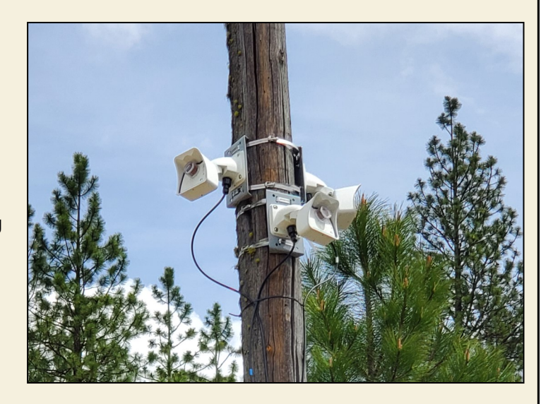
Finished airport weather camera installation.

You can view the FAA WeatherCam map at: <a href="https://weathercams.faa.gov/">https://weathercams.faa.gov/</a>. Please note that there is an extensive review period before cameras go live online, so some of the new sites may not yet be viewable. Check the site regularly for updates as cameras are added to the system.