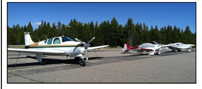
Tent, campground sign, and aircraft at the WYS Campground.