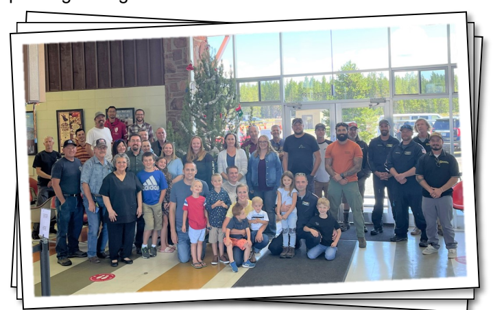
Celebrating Christmas in August at the Yellowstone Airport. Photo courtesy of Montana Aeronautics.

Christmas in August originated in Yellowstone National Park after snow blanketed the landscape the night of August 24, 1925. The following day, park staff and visitors at Fishing Bridge decided to throw an impromptu Christmas party to celebrate the snow. They enjoyed food, exchanged a few small gifts, and "Christmas in August" was born. Since the airport is closed during the actual holiday season, this early celebration gives staff and friends of the airport the opportunity to come together and celebrate as the operating season winds down. An explanation of the event can be found hung on the Christmas tree for those passing through the terminal.