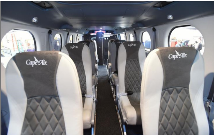
Tecnam P2012 Traveller