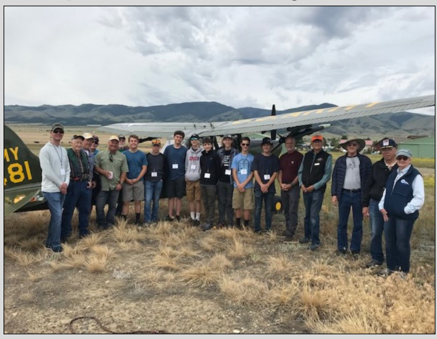
2019 ACE Camp—Canyon Ferry Fly-In

On the first day, students will learn survival skills, signaling, and fire and shelter construction during a campout in the mountains. Later in the afternoon, students will have an opportunity to signal a search plane to their location in the mountains using their newly learned rescue methods.