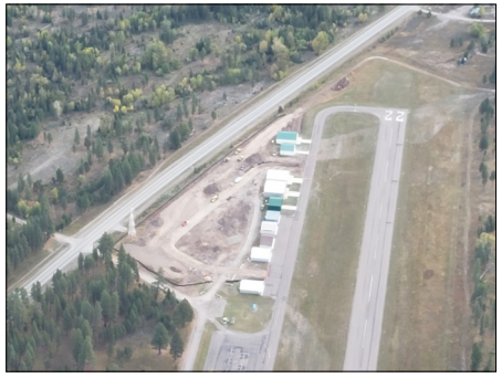
Lincoln Airport project

The FAA's Northwest Mountain Regional Office has reached out amid concerns over AIP (Airport Improvement Program) funding for FY2020 due to the COVID-19 pandemic. As the FAA offices of airports employees are remaining in constant contact with airport sponsors to award funding and ensure