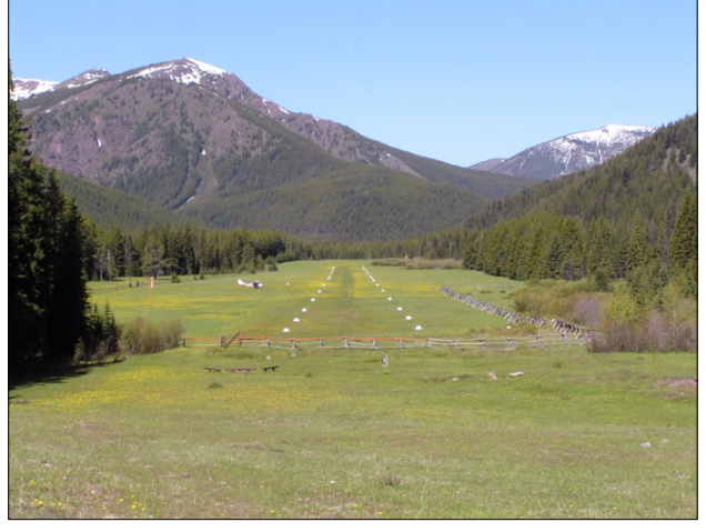
Schafer Meadows

Schafer will undergo a runway improvement project beginning in May. Work will be performed with traditional horse-drawn equipment. Check NOTAM's for updates on the project, runway usability and status before flying into Schafer (or anywhere)!