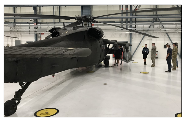
ACE students tour a Blackhawk at the Helena Army National Guard

Contact Aeronautics to set up your sponsorship! Call (406) 444-2506 or email <a href="mailto:mdtaerosafetyed@mt.gov">mdtaerosafetyed@mt.gov</a>.