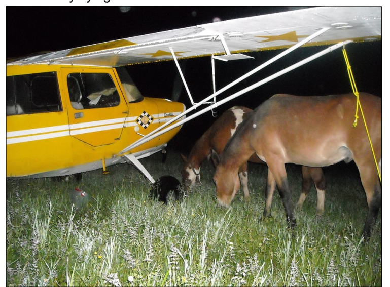
Mule graze on runway and near aircraft at Schafer backcountry airstrip.

As we move into spring, we are left with a strong desire to return to these prized strips. Hopefully we spend our time preparing our knowledge and skills to have another safe backcountry flying season.