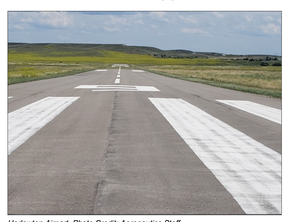
Harlowton Airport

The FAA proposed to establish two pieces of Class E airspace extending upward from 700 feet or more above the surface at the Harlowton Airport. The new airspace will allow IFR operations for the airport.