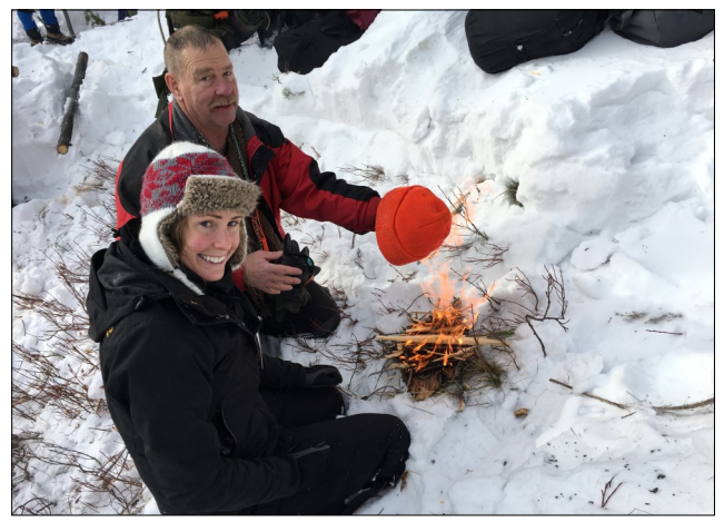
Students learn survival skills during the 2017 Winter Survival Clinic

ue to popular demand and funding made possible by HB661, the winter survival clinic is back for 2020! The course filled up very quickly, but there is a waiting list for additional attendees. If you would like to get on the waiting list, please contact us as soon as you can. The clinic is happing soon!