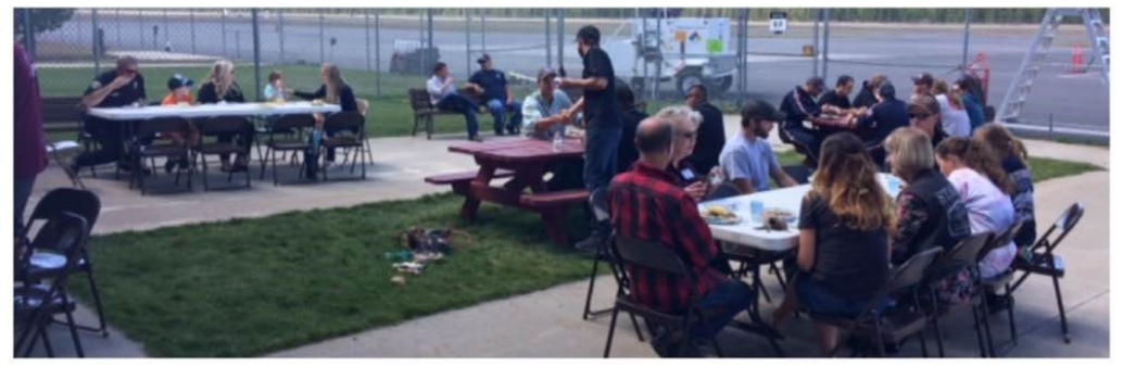
Yellowstone Airport staff, their families and Santa celebrated Christmas in August

Every year at the Yellowstone Airport, a celebration known as "Christmas in August" is held. This event stems from the original "Christmas in August" event inside Yellowstone National Park. On August 24, 1925, at Fishing Bridge in Yellowstone National Park, it snowed on the tourists! The tourists and park staff decided to have an impromptu Christmas celebration the next day on August 25<sup>th</sup>. They enjoyed food and exchanged a few small gifts, and "Christmas in August" was born!