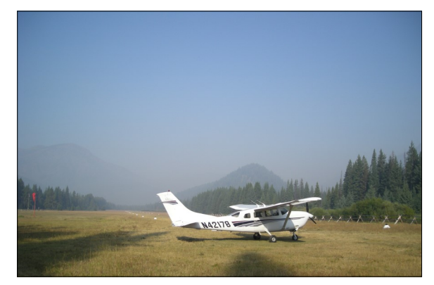
Schafer Meadows backcountry strip.

When we speak of aircraft performance, we're usually answering 3 basic questions: How much can I haul? How far can I go? How long will it take me?