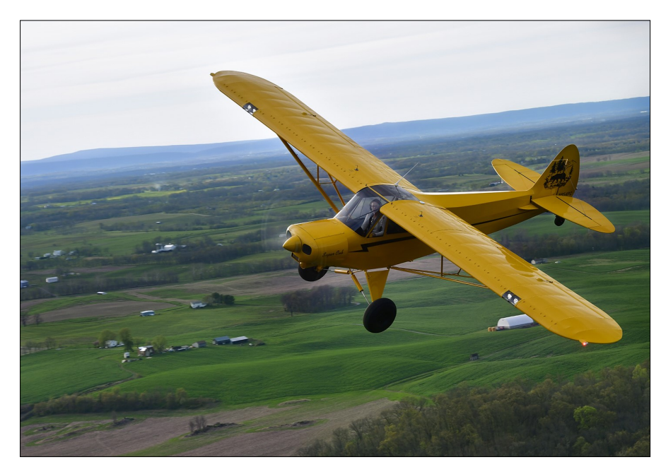
The AOPA Sweepstakes Super Cub soars over the Virginia countryside. The Super Cub spent half of the sweepstakes on tundra tires but will be given away on amphibious floats.

Roger and his son, Darin, spent about 2,000 hours meticulously restoring the aircraft and applying more than 30 supplemental type certificates to enhance its performance. The poly-fiber fabric covering and high-gloss Lock Haven Yellow paint are so smooth that pilots can't resist touching the airplane.