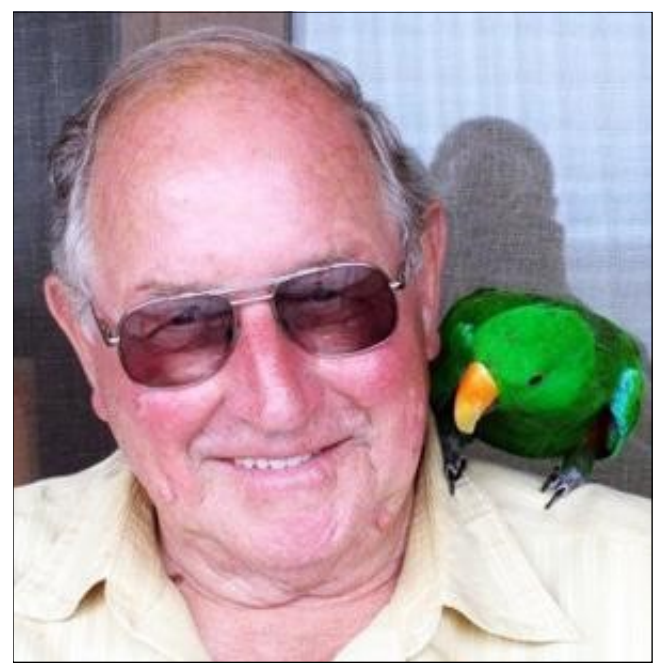
Lisle Eugen Wood