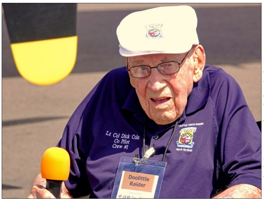
Lt. Col Dick Cole

If you don't operate in "Out" airspace, but plan to equip anyway, you have time on your side. Since the 2020 mandate may not apply to the way you fly, you can wait for a better installation window at your avionics shop, for lower prices or new and better (hopefully portable) equipment options. This may not be the best decision, however. The more traffic you can see, and the more traffic that can see you, the safer our National Airspace System will be.