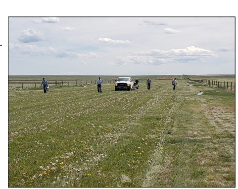
Volunteers eradicating rodents.

For those desiring to utilize the Del Bonita airport for border crossings, Canadian Customs can be reached at (403) 758-3613, and U.S. Customs can be reached at (406) 336-2130. Call Customs at least two hours before arrival.