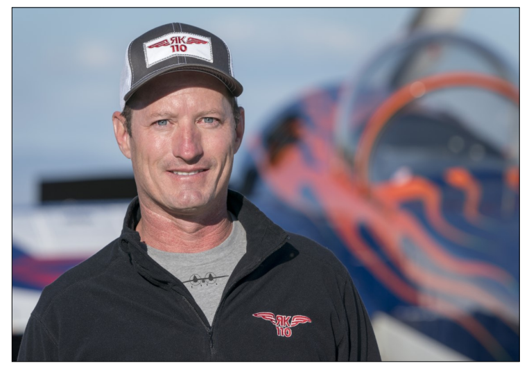
Jeff Boerboon