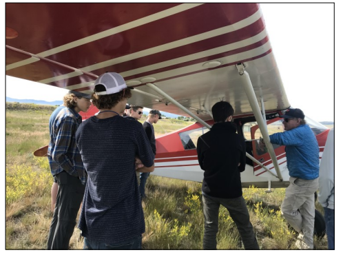
All pictures above taken during Canyon Ferry fly-In