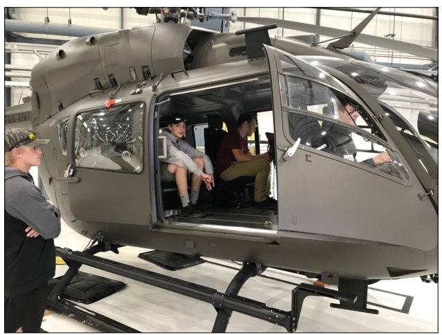
Students sit in a Lakota EC-145

In early summer the Aeronautics Division put on its youth summer camp called ACE Academy (Aviation Career Exploration). ACE is an exciting, two-day program for high school students considering a career in aviation or for those with an interest in aviation. The students were able to go on airplane flights, attend a general aviation fly-in at Canyon Ferry Lake and tour the Helena air traffic control tower, Montana Air National Guard helicopter facility, the DNRC fire suppression air wing, Helena College aircraft mechanic program, the Helena Airport and airport fire rescue program, an air ambulance and charter service and a crop dusting operation. The goal of this camp is to expose students to some of the many career possibilities in the aviation field in hopes to inspire more youth to join the industry.