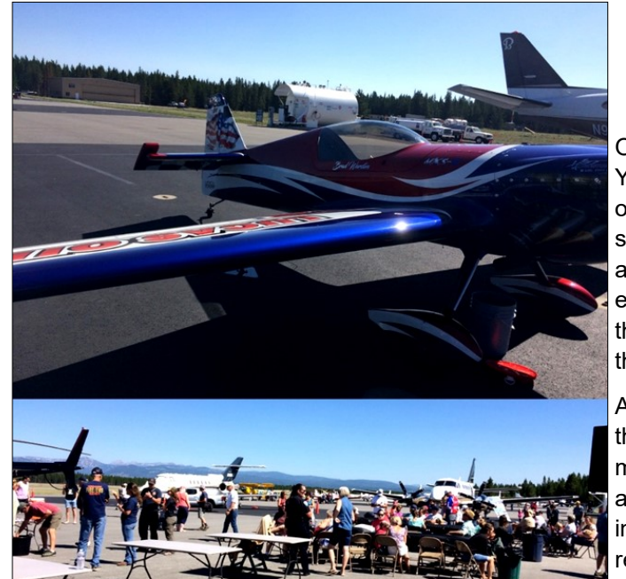
Brad Wursten's MSX-R aircraft, Air Fair attendees enjoying events

some bison inching towards the road, a problem that many park visitors can relate to. The trip to Yellowstone wrapped up the vice president's two day visit to Montana and it surely left a positive impact on the town of West Yellowstone and the airport after being in the spotlight.