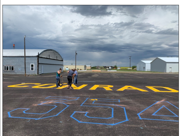
Montana 99s working on Conrad Airport air-marking.

June 7th began the air-marking season this year for the Montana 99s. The 99s started the season by teaching the Wyoming chapter how to paint a compass rose at Hot Springs, SD. The 1100 mile roundtrip was accomplished over the weekend with 4 members of the Montana Chapter participating. June 29th found the Montana 99s at the Twin Bridges airport which had patiently waited since 2018 for their air-marking. The new air-mark was placed directly in front of the camping area off the parking ramp.