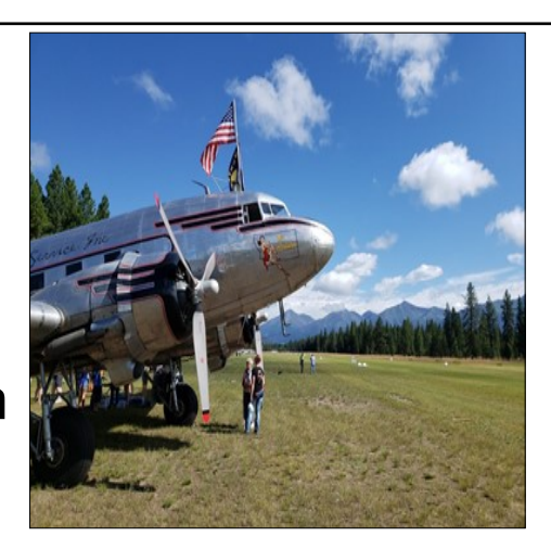
DC-3 Miss Montana

Saturday afternoon on July 13 the Seeley Lake Airport had about half a dozen aircraft fly-in. The weather deteriorated Friday evening and many aircraft could not make it. Lindey's food truck served steak sandwiches for dinner Saturday night, most attendees that flew in camped overnight on the field in the rain.