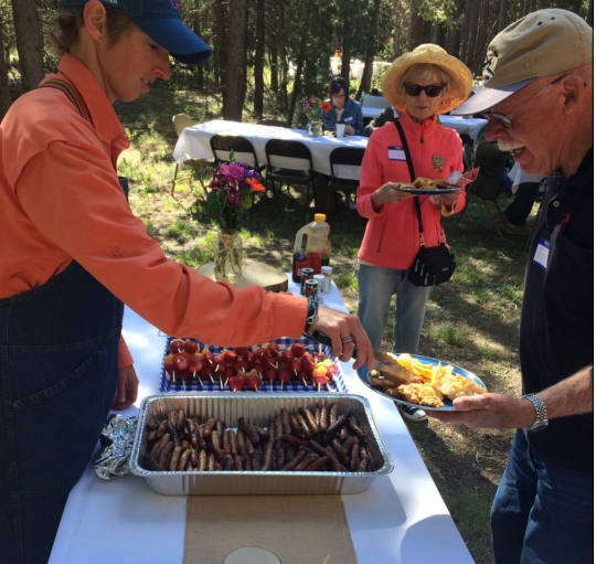
Breakfast is enjoyed by many at Yellowstone Airport campground.

On Saturday, June 29, 2019, Yellowstone Airport hosted an event put on by the Recreational Aviation Foundation (RAF), which is an organization that works to preserve, maintain, and create general aviation air strips. The organization was founded by a group of Montana pilots who wanted to work to protect aviation against the threat of airstrip closures. The organization puts on multiple events each year to help bring pilots together and advocate for their common cause.