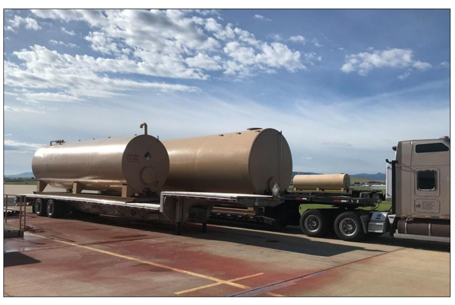
10,000-gallon tank on the left is replaced by the 25,000-gallon tank on the right

Shown in the pictures is a 10,000-gallon unit on the left and 25,000-gallon unit on the right.