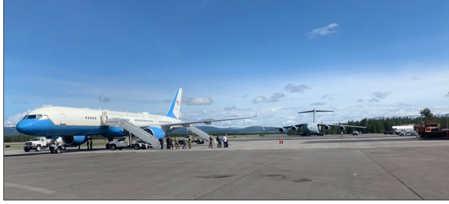
Mike and Karen Pence visit West Yellowstone

some bison inching towards the road, a problem that many park visitors can relate to. The trip to Yellowstone wrapped up the vice president's two day visit to Montana and it surely left a positive impact on the town of West Yellowstone and the airport after being in the spotlight.