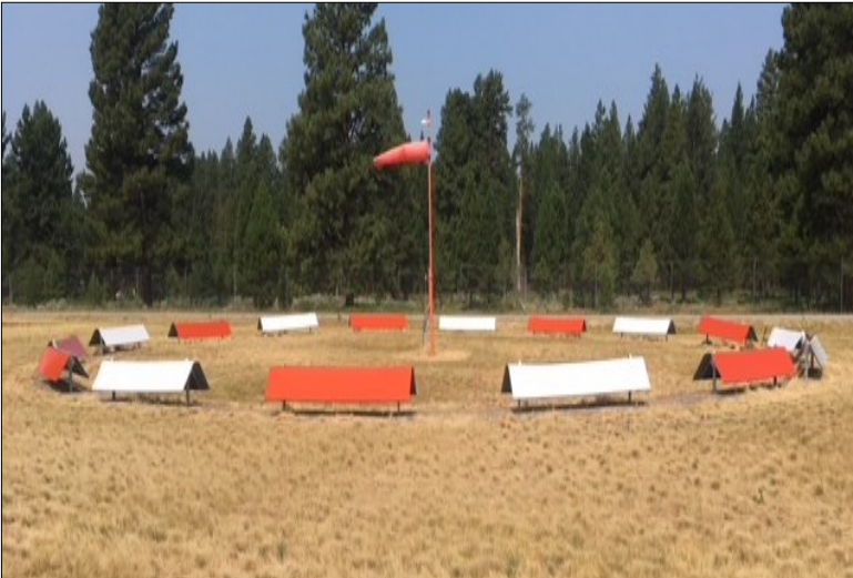
Before and after pictures of segmented circle panels at Lincoln Airport.