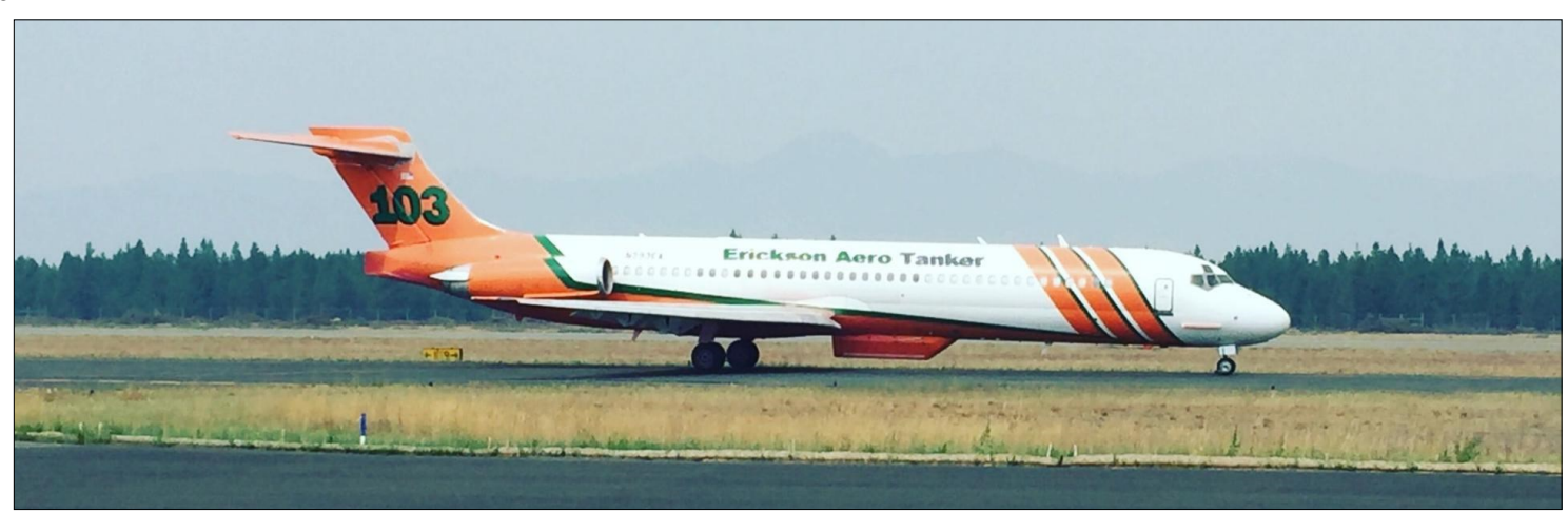
MD-87 - Tanker 103 on taxiway at Yellowstone Airport

According to the Tanker Base Manager, Yellowstone Airport has possibly the quickest operation turn-around time in the nation. The MD-87 averaged only twelve minutes on the ground from the time the aircraft stopped at the base for loading until takeoff roll.