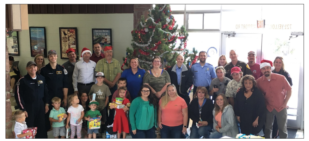
Employees, community members, friends, and family gather for a potluck lunch.