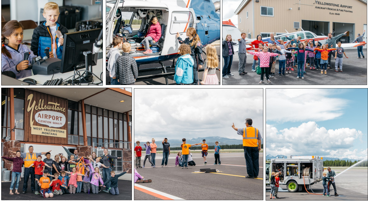
First and fourth grade West Yellowstone students

The field trip ended with the students rotating through a variety of activities. They had the opportunity to fly a Cessna 172 flight simulator, tour a Beechcraft Bonanza, climb through the airport's two firetrucks, build a balsa wood aircraft, and learn about Air Methods' medical transport helicopter and operations. The students had a great time at the airport, and many hope to make a career for themselves in the aviation industry in the future.