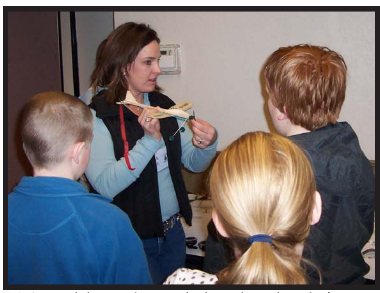
Aviation workshop teachers taught the students about the four fundamental forces of flight.