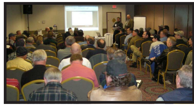
A full house of mechanics learn the latest and greatest in aviation maintenance.

For A&P mechanics renewing an IA must show completion of one of the five activities in §65.93 (a) (1) through (5) below by March 31 of the first year of the two-year inspection