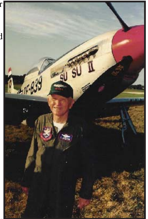
Col. Frank Borman

To register for the conference a registration form is included on page 4 of this newsletter. Those who preregister are eligible for a special drawing – you need not be present to win. Rooms have been blocked at the Holiday Inn Grand Montana in Billings at a conference rate of $70 plus tax. Please call (877) 554-7263 or (406) 248-7701 to make reservations and reference Montana Aviation Conference. We look forward to seeing you there!