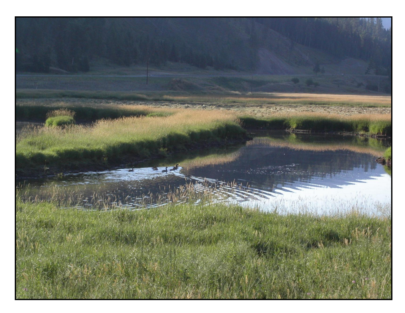
Click the icon below for complete monitoring reports for this site (2010)