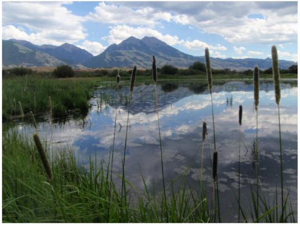
Click the icon below for complete monitoring reports for this site (2010)