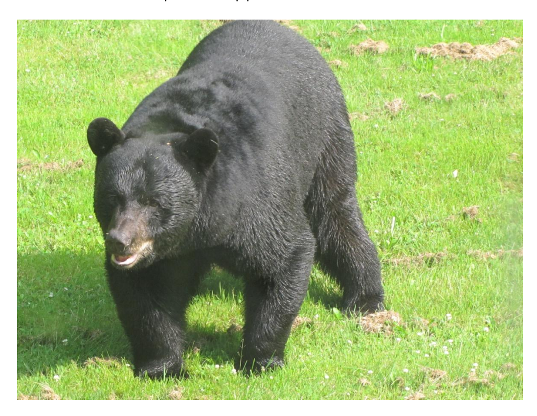
Black Bear – Ursus Americanus