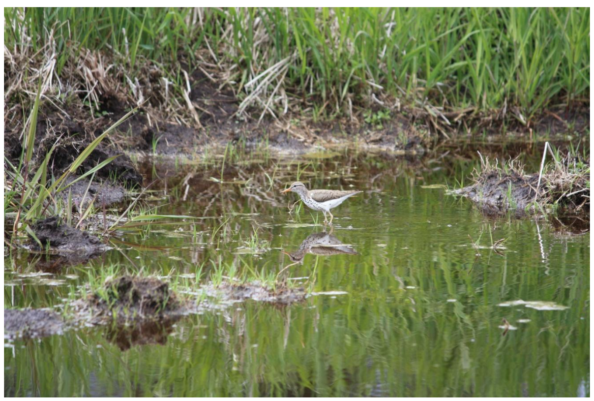
Spotted Sandpiper – Actitis macularius