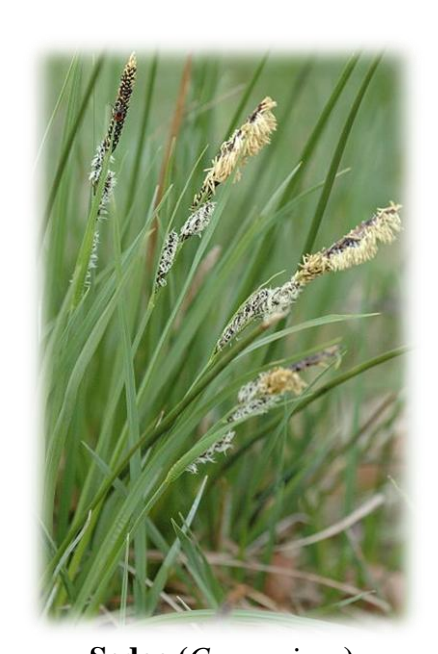
Sedge (Carex nigra)