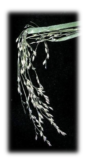
Tall Manna Grass