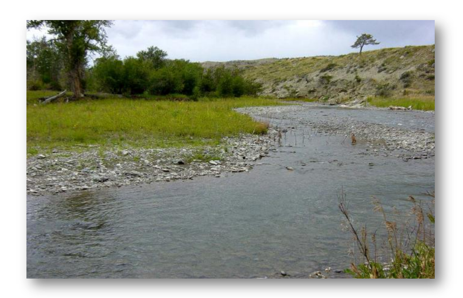
Click the icon below for complete monitoring reports for this site (2004 to 2009)