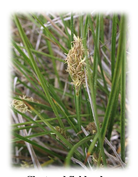
Clustered field sedge