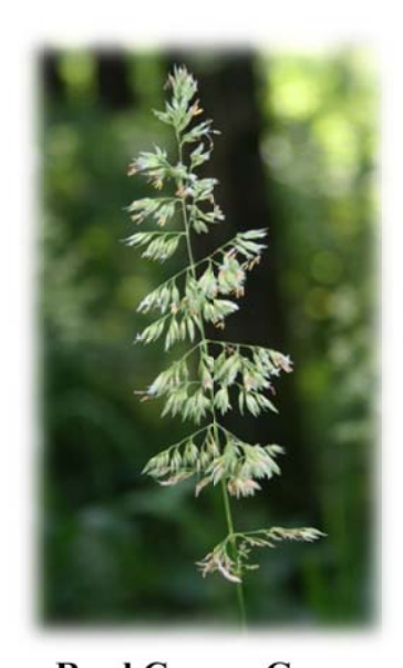
Reed Canary Grass