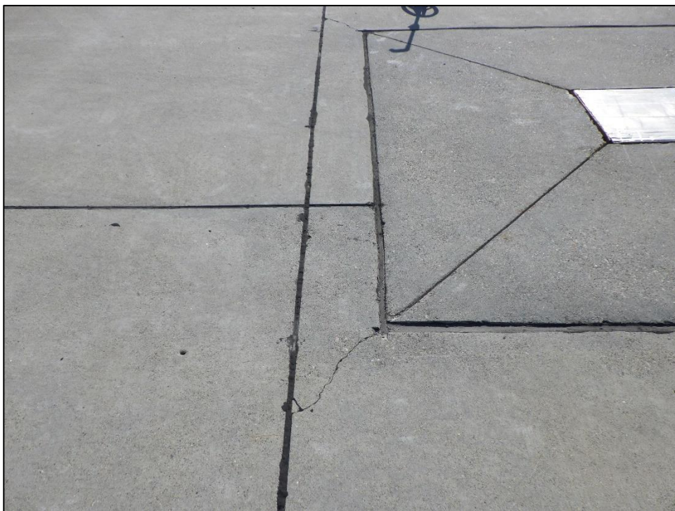
AP05-01: Corner Break