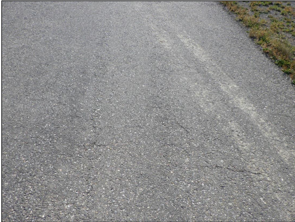
TW02-02: L&T Cracking