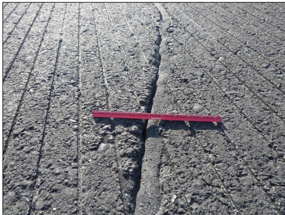
RW01-01-85: L&T Cracking