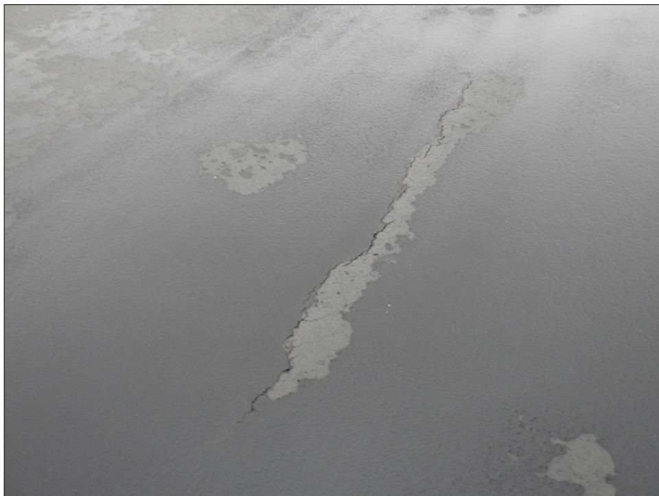
TW05-13: L&T Cracking