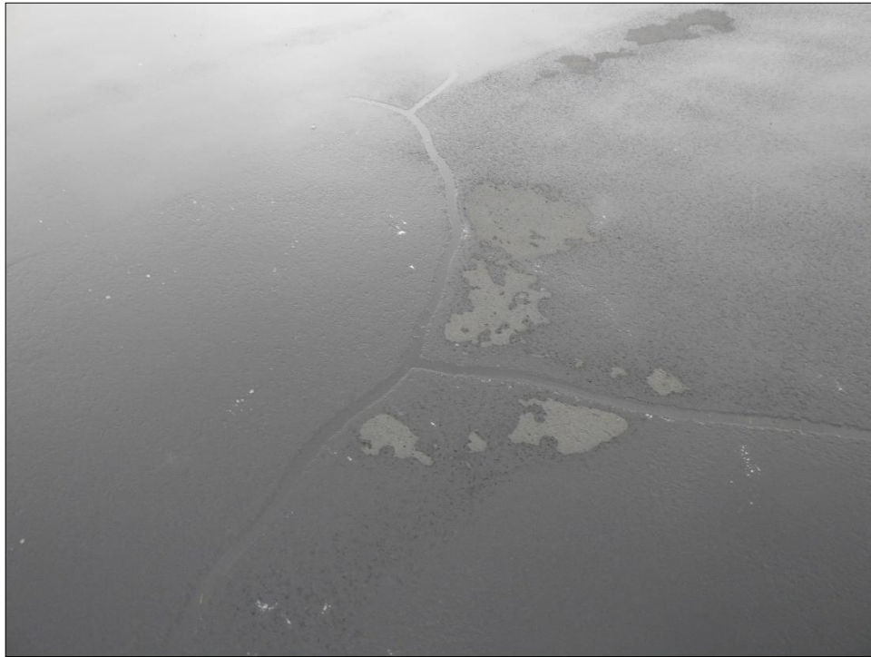
AP11-17: L&T Cracking