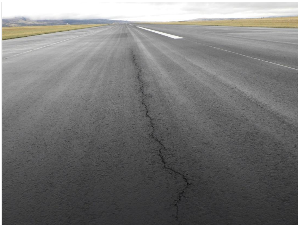
RW04-11-07: L&T Cracking