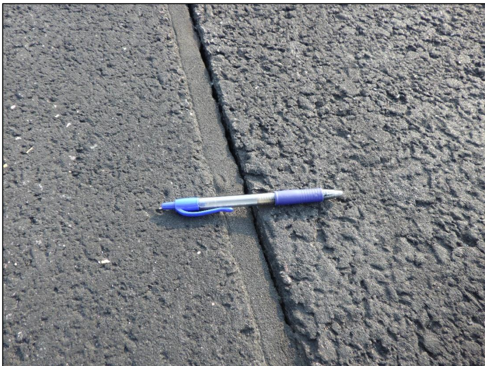
RW04-11-63: L&T Cracking