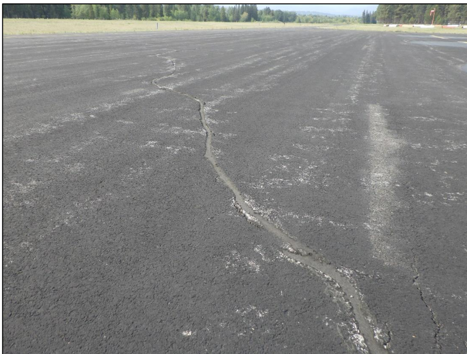
AP11-10: L&T Cracking