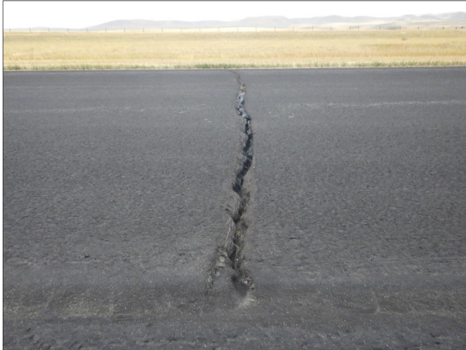
RW04-04-50: L&T Cracking