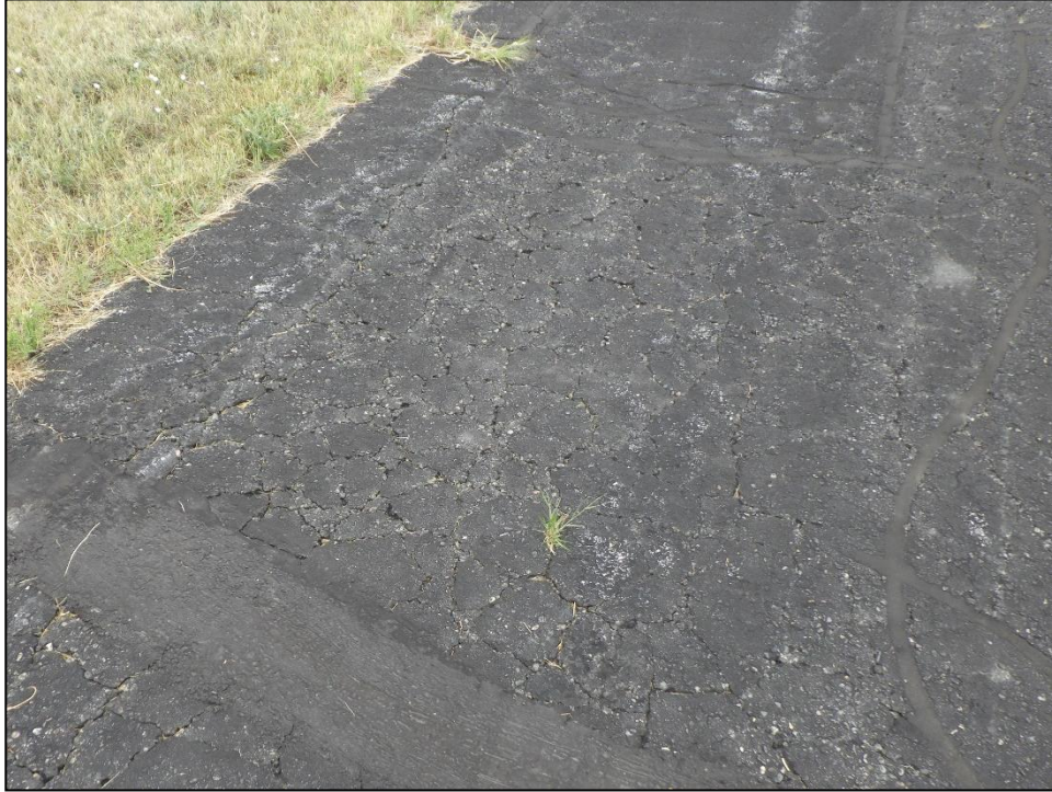
TW01-07: Alligator Cracking