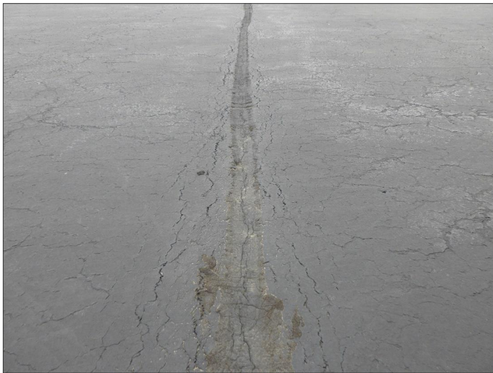
AP03-21: L&T Cracking