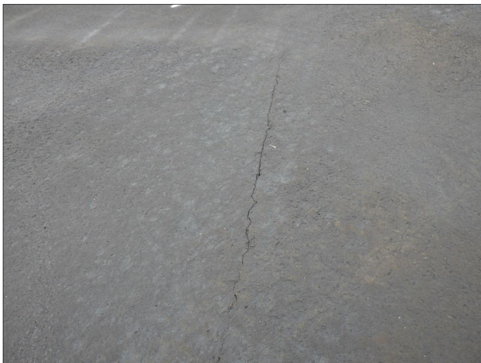
TW21-10: L&T Cracking