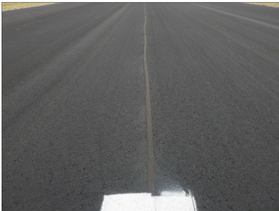
RW09-21-14: L&T Cracking