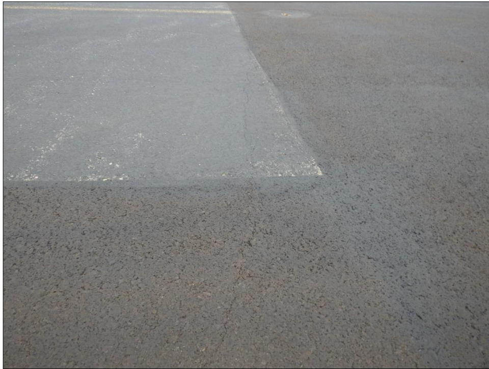
AP21-05: L&T Cracking