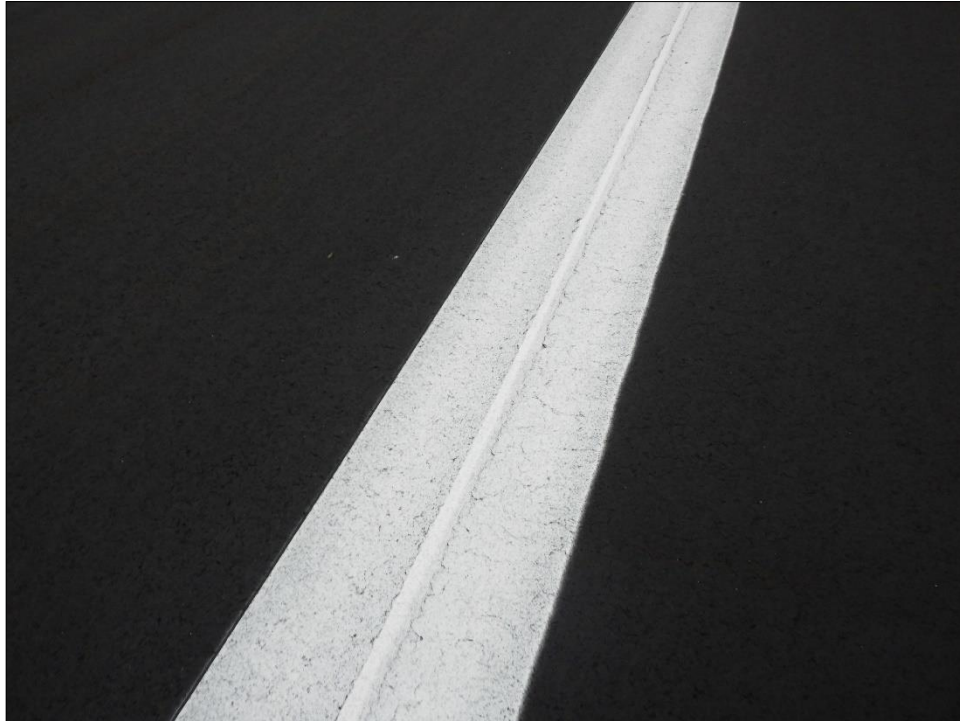
RW09-21-05: L&T Cracking