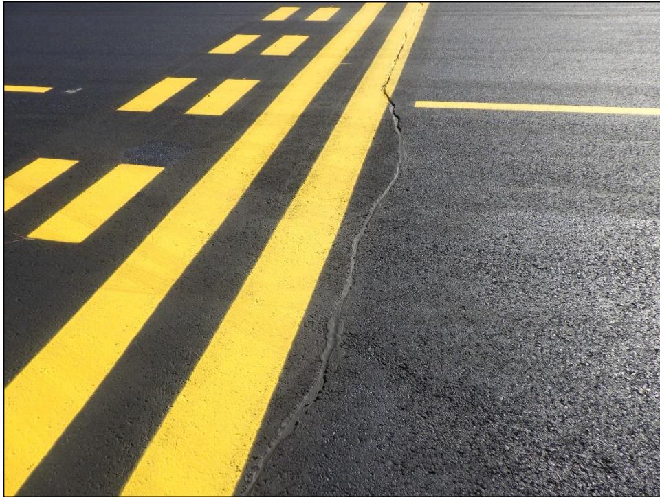
TW01-08: L&T Cracking