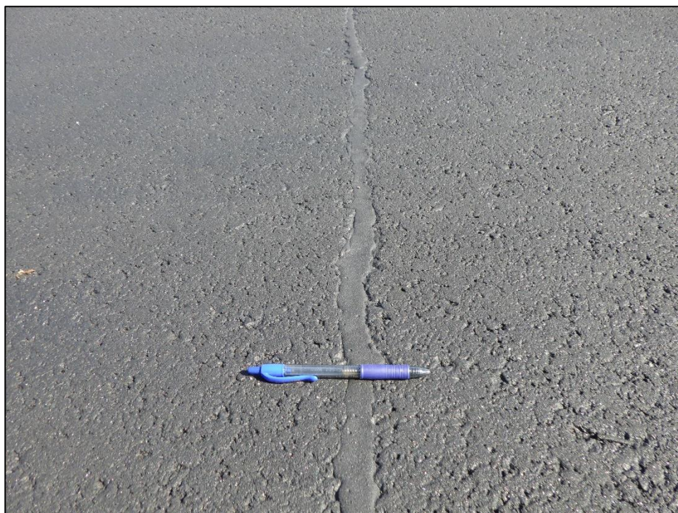
RW01-01-62: L&T Cracking