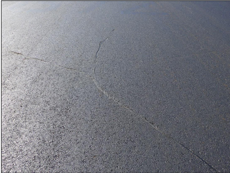
AP01-08: L&T Cracking