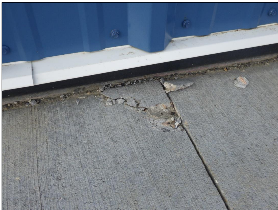
AP02-02: Corner Spalling