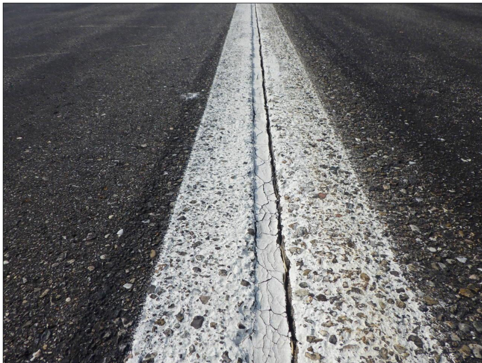
RW13-01-05: L&T Cracking