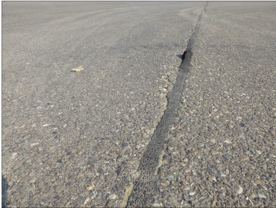
AP01-01: L&T Cracking