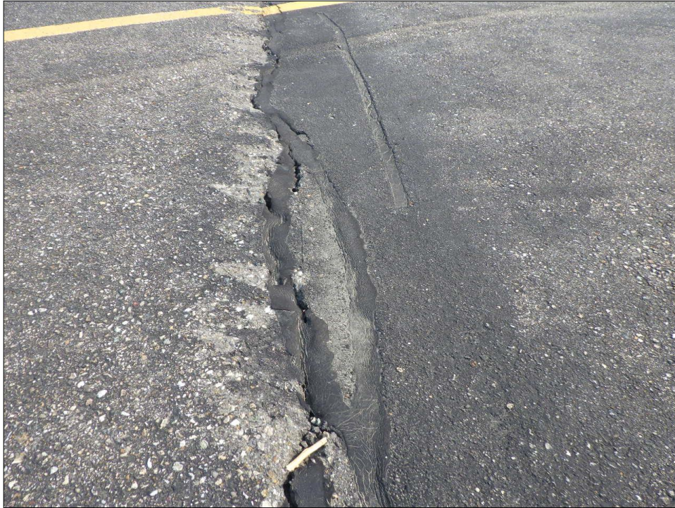
TW01-05: L&T Cracking