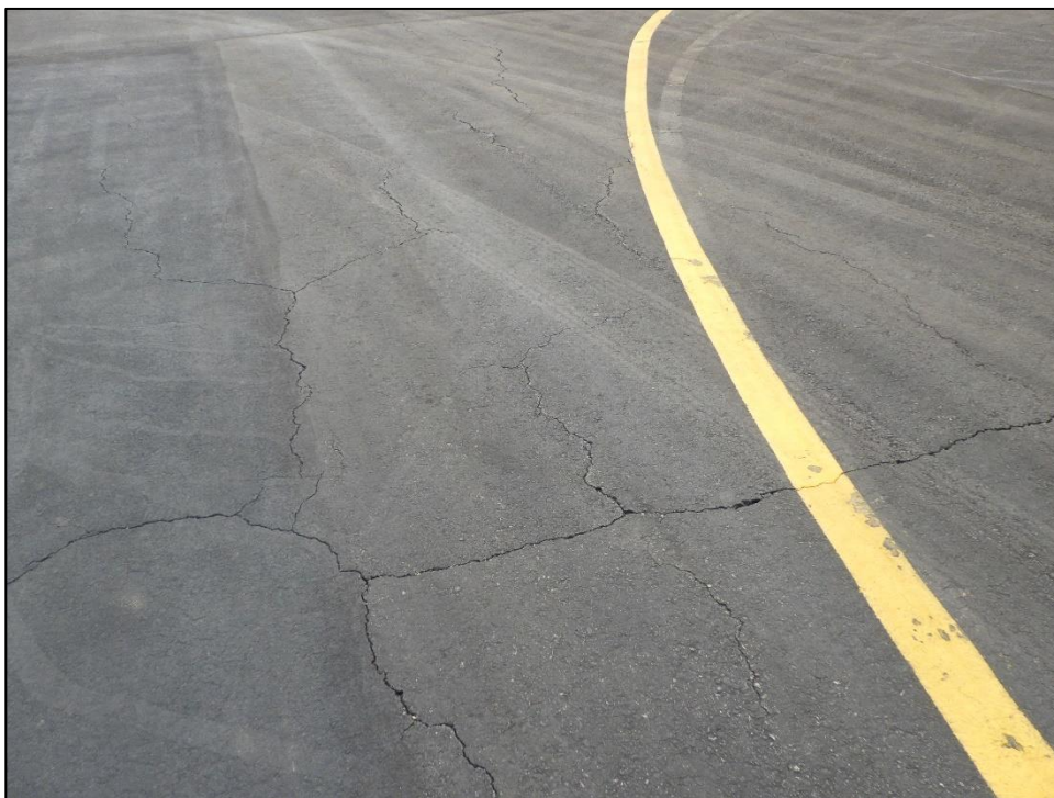
AP04-03: Block Cracking