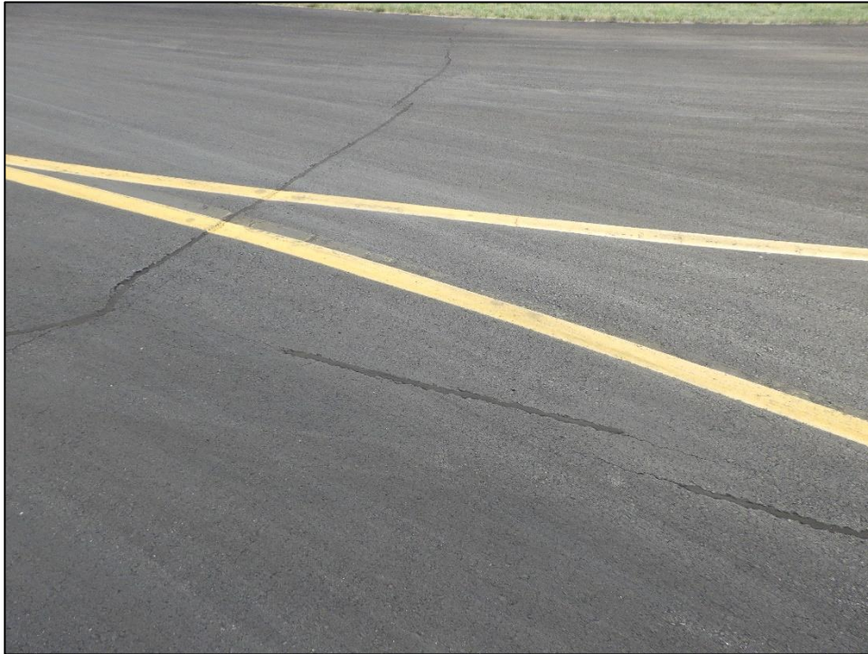
TW01B-01: L&T Cracking