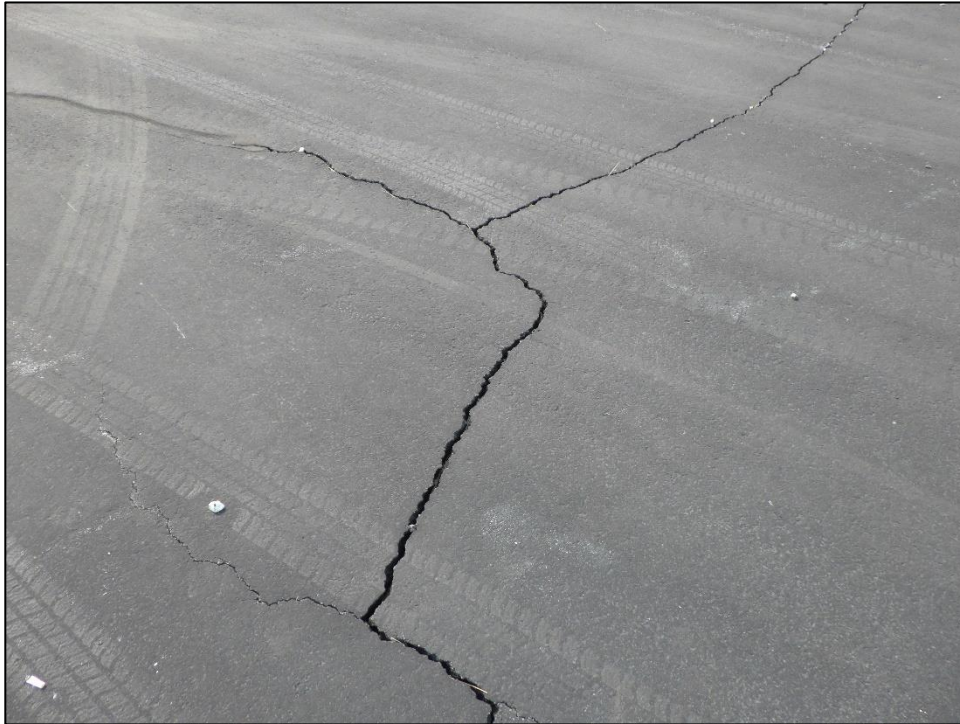
AP03-09: L&T Cracking