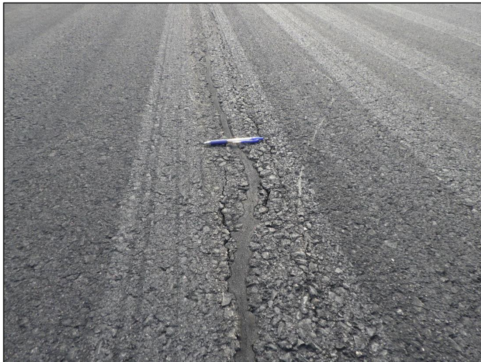
RW13-03-35: L&T Cracking