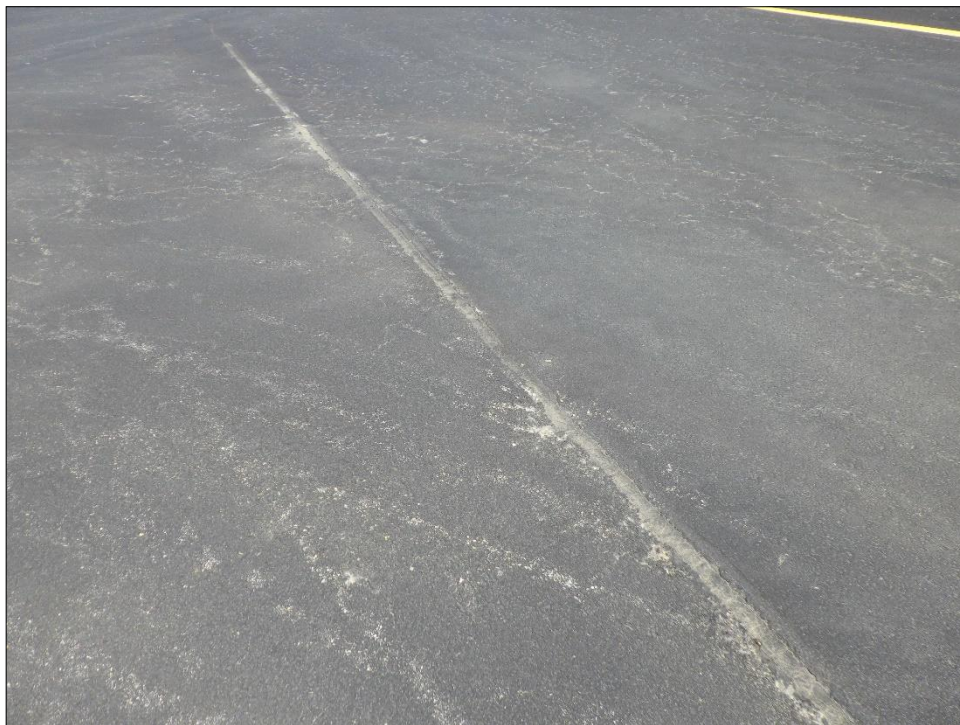
TW02-01: L&T Cracking