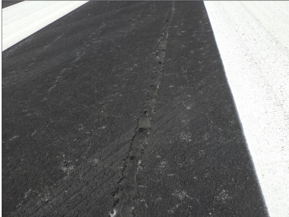
RW06-01-03: L&T Cracking