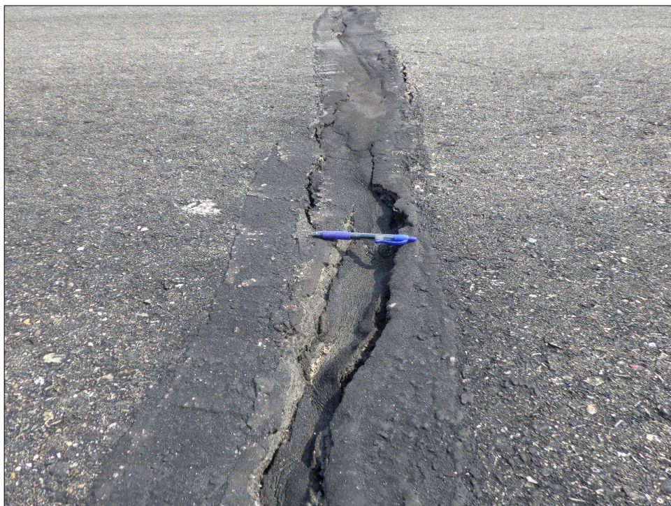
RW11-11-26: L&T Cracking