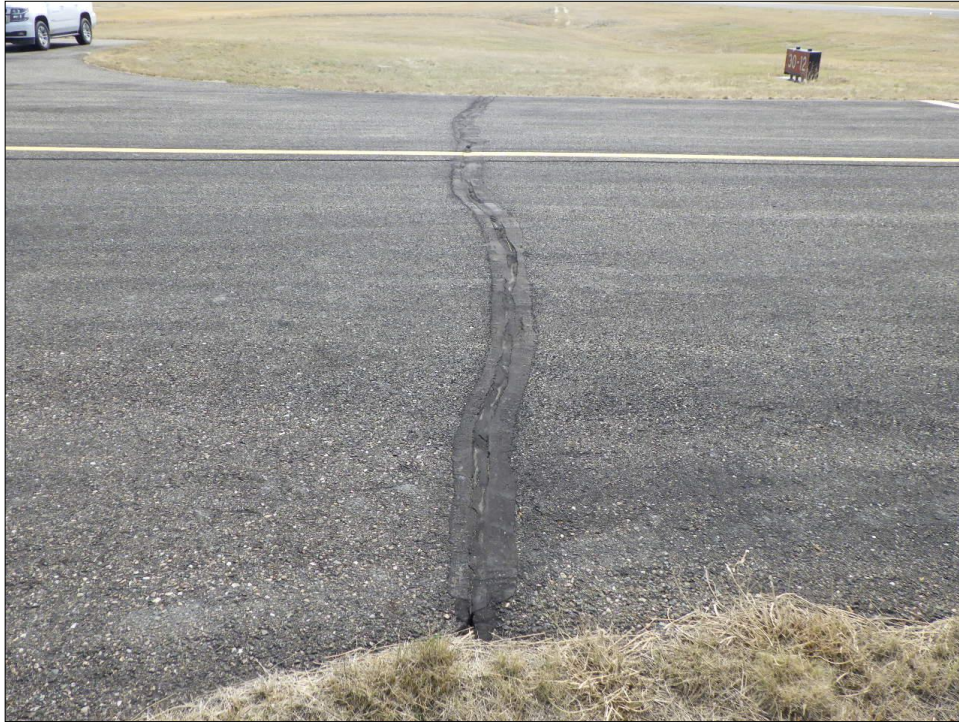
TW01-01: L&T Cracking