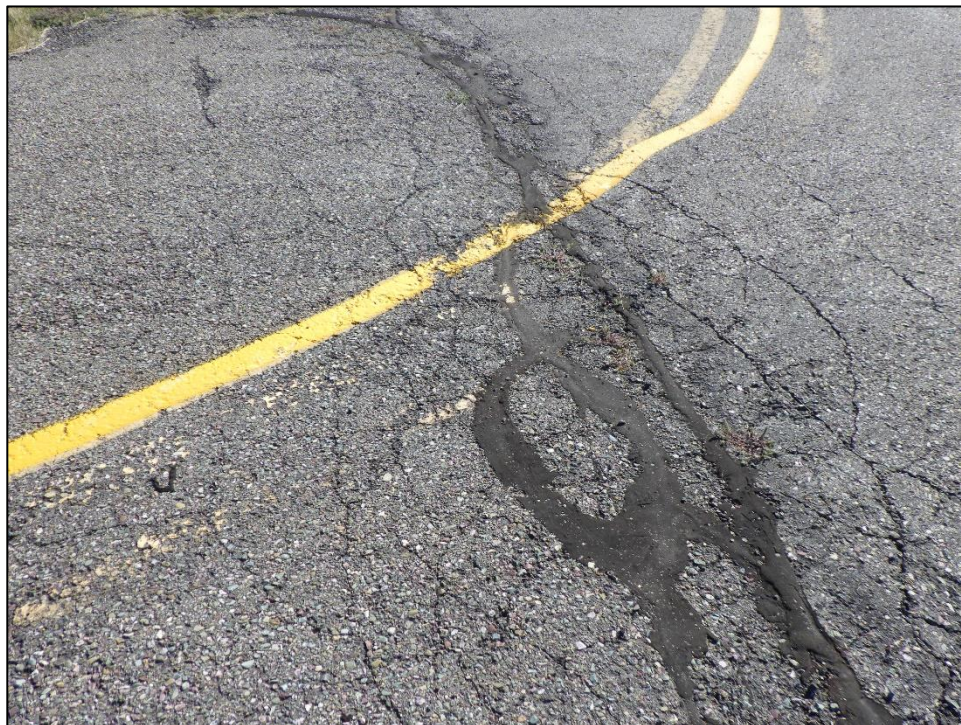
TW01-01: Alligator Cracking