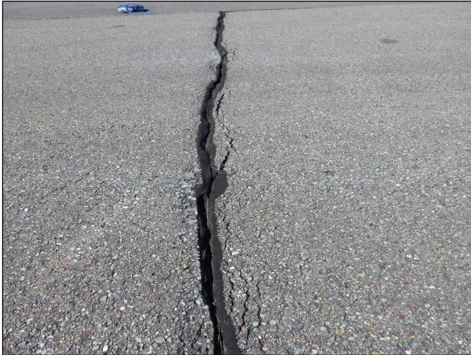
AP01-02: L&T Cracking