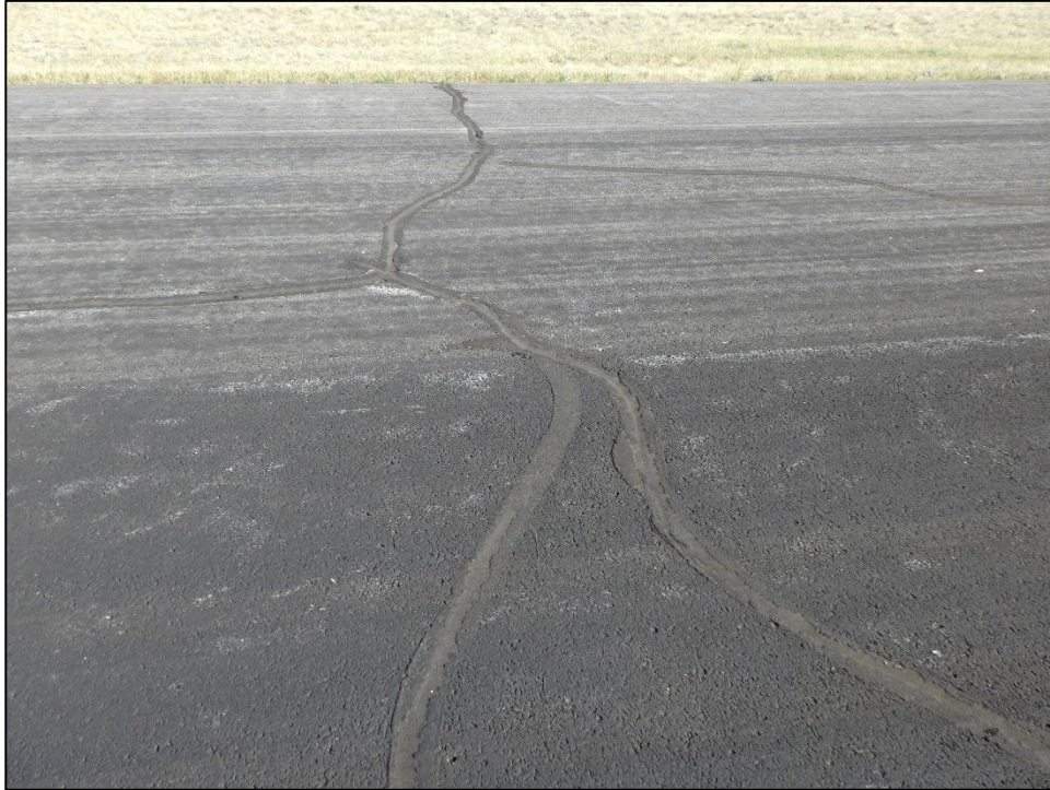
RW06-01-06: L&T Cracking