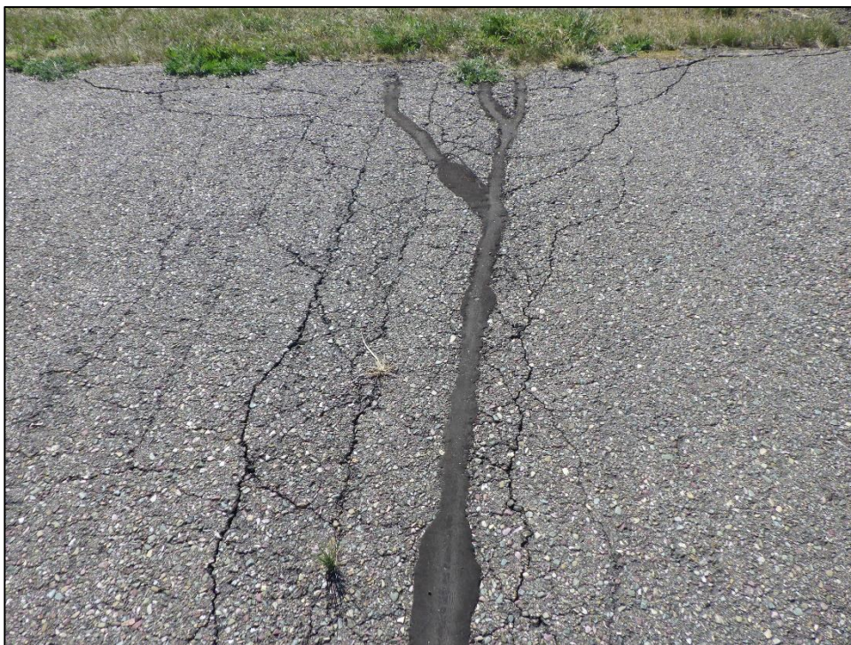
AP01-03: Alligator Cracking