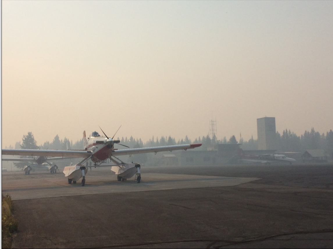
SEATs (Single Engine Air Tanker) AT-802

The Yellowstone Airport is home to the West Yellowstone Fire Center. The United States Forest Service has owned and operated the smokejumper base since 1955. The base was originally established at the old airport west of the town of West Yellowstone before the airport moved to its current location in 1965 where it still operates today. Nationwide, there are approximately 450 smokejumpers, and WYS is home to 28 of them. The primary mission for the base is for a quick response to any wildland fires within the regions of Yellowstone National Park, Teton National Park, Gallatin Custer, and Caribou-Targhee National Forests. However, the smokejumpers are prepared to deploy anywhere in the nation when needed.