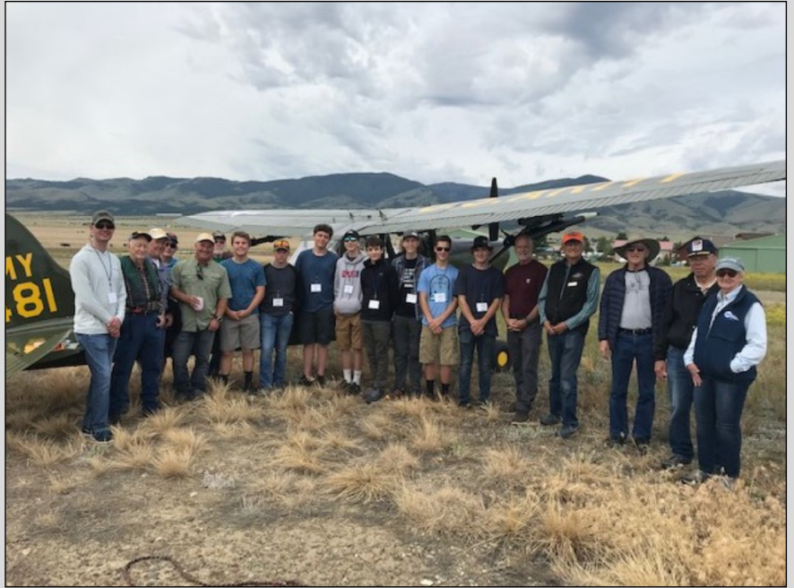
2019 ACE Camp—Canyon Ferry Fly-In

On the first day, students will learn survival skills, signaling, and fire and shelter construction during a campout in the mountains. Later in the afternoon, students will have an opportunity to signal a search plane to locate them in the mountains using their newly learned rescue methods.