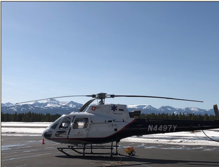
Air Methods air ambulance American Eurocopter AS350B3

Due to the impacts of the COVID-19 Pandemic, Air Methods had to reduce and remove its winter operations this past season. The airport and Air Methods are pleased to see the return of this vital service.