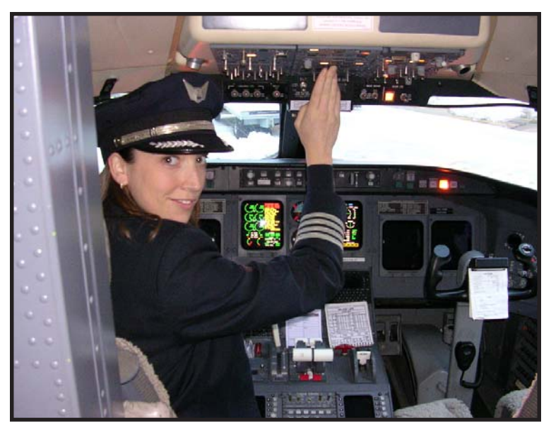
Do you see yourself in command of this airplane? Sign up for this year's MDT Aeronautics Division's Aviation Career Academy (ACE) and take control!

Montana students have the chance to find out for themselves if an aviation career is right for them during the Aviation Career and Interest Academy (ACE). The Montana Department of Transportation Aeronautics Division is sponsoring the two- day academy for students in 7<sup>th</sup>, 8<sup>th</sup> and 9<sup>th</sup> grade (for the school year 2007/2008).