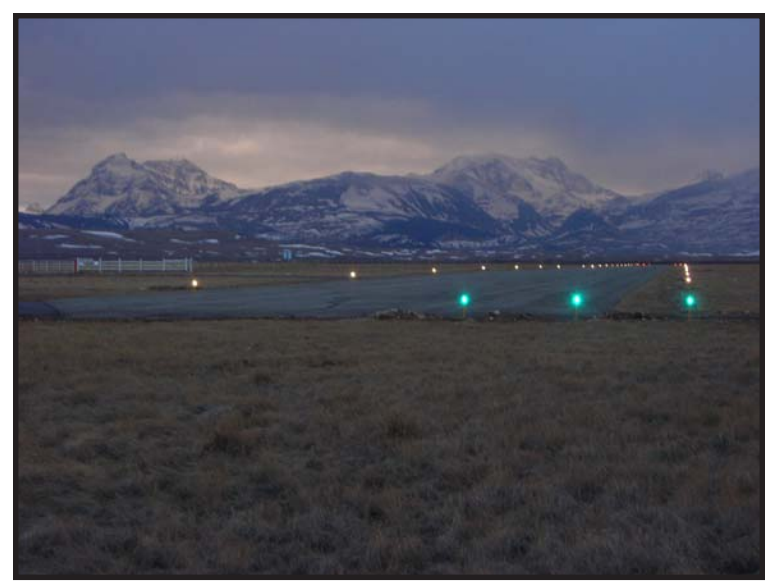
Browning Airport offers pilot controlled lighting.

For those of you that might want to fly into Browning Airport, the airport is a paved facility over 4000' long and 75' wide with a beacon and pilot controlled lighting. The wind is almost always stiff and almost always out of the west, making landing on runway 24 the usual procedure. The closest weather and altimeter can usually be found by listening to the Cut Bank ASOS on 119.025 or by telephone at (406) 873-2939. Browning Airport has a paved parking area with tiedowns, however, no services are available on site. Browning uses the unmonitored common traffic advisory frequency of 122.9 for air to air communications. There is also a phone available on field. For further information, you can contact the Division at (406) 444-2506, or contact our on site representative, Mr. Gary Nevins at (406) 338-7169.