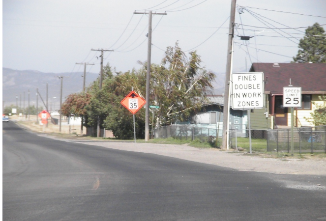
Permanent Posted Sign at 25 mph with Construction Step Down Signs

The photo above shows a typical placement of the step down signs series even though the permanent speed limit sign is 25 mph. The Detailed Drawings call out these signs however, traffic control contractors and MDT construction crews must be aware of the existing project circumstances before implementing the step down signs.