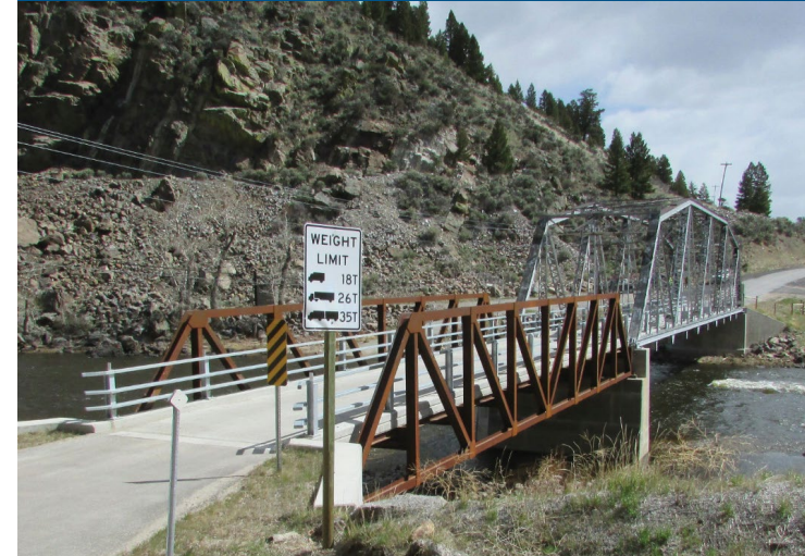
How to understand and interpret Montana's bridge weight restrictions and signs.